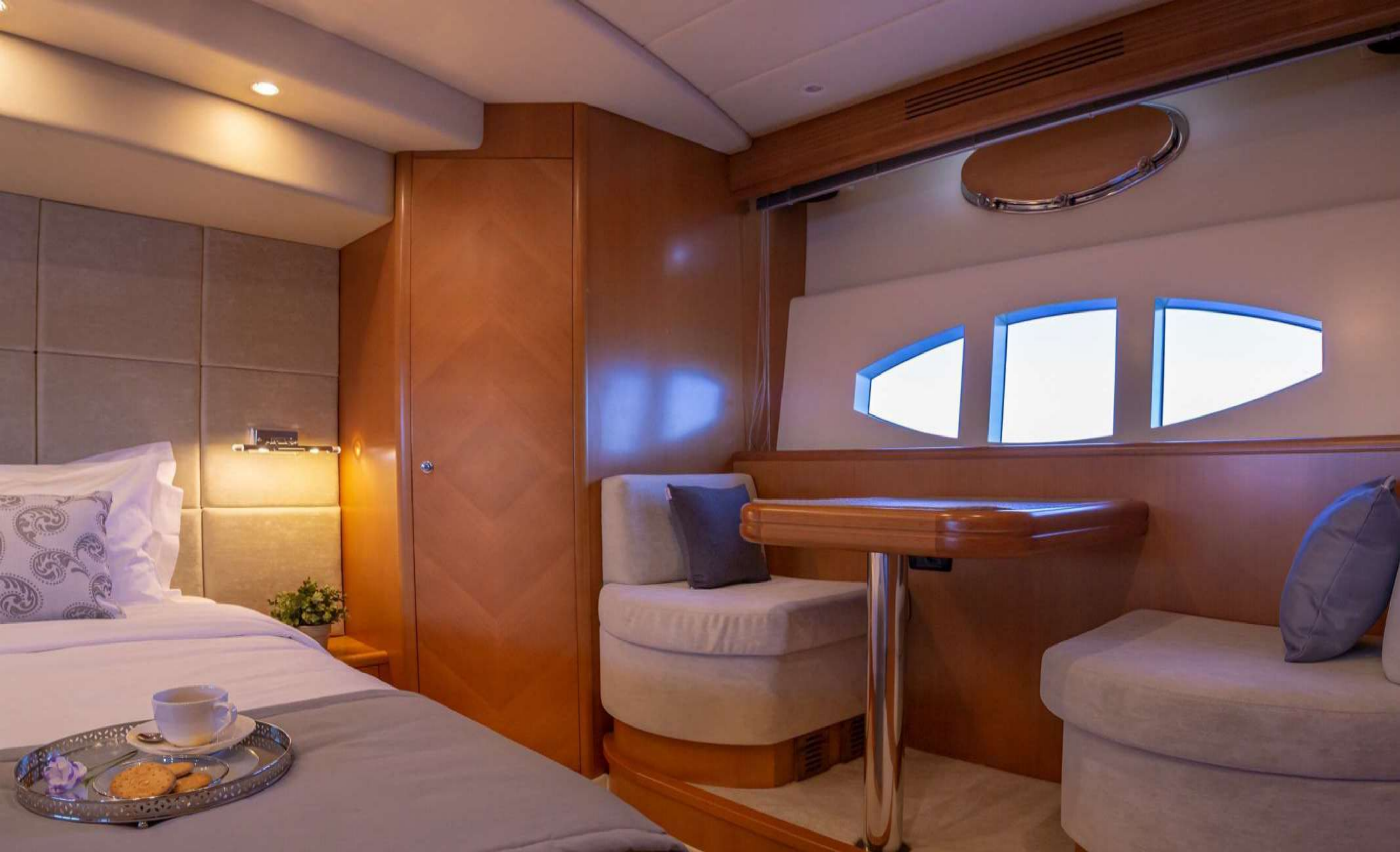
Master other view