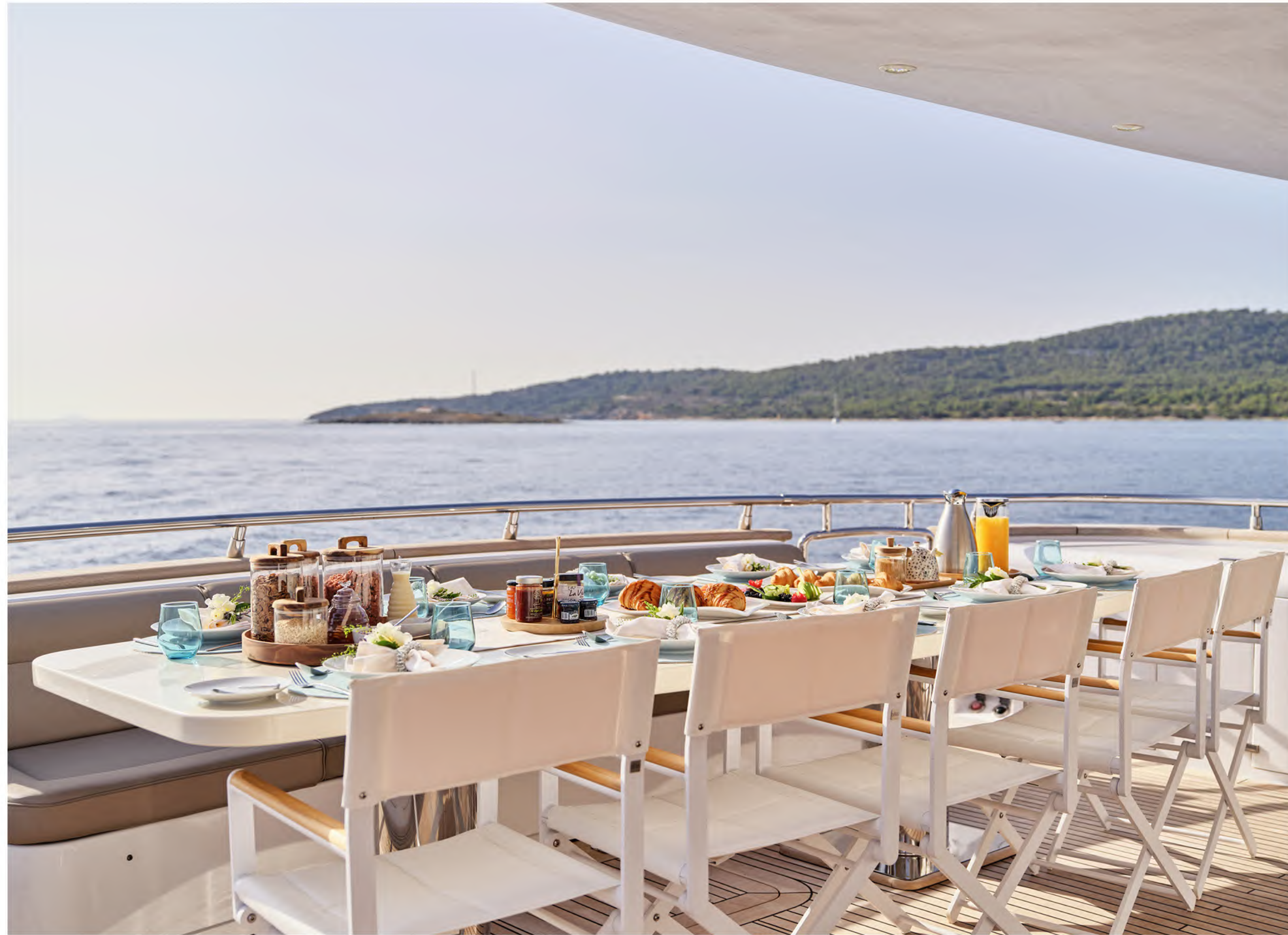
spacious & elegantly designed the aft deck offers an inviting setting for alfresco dining & leisure ■