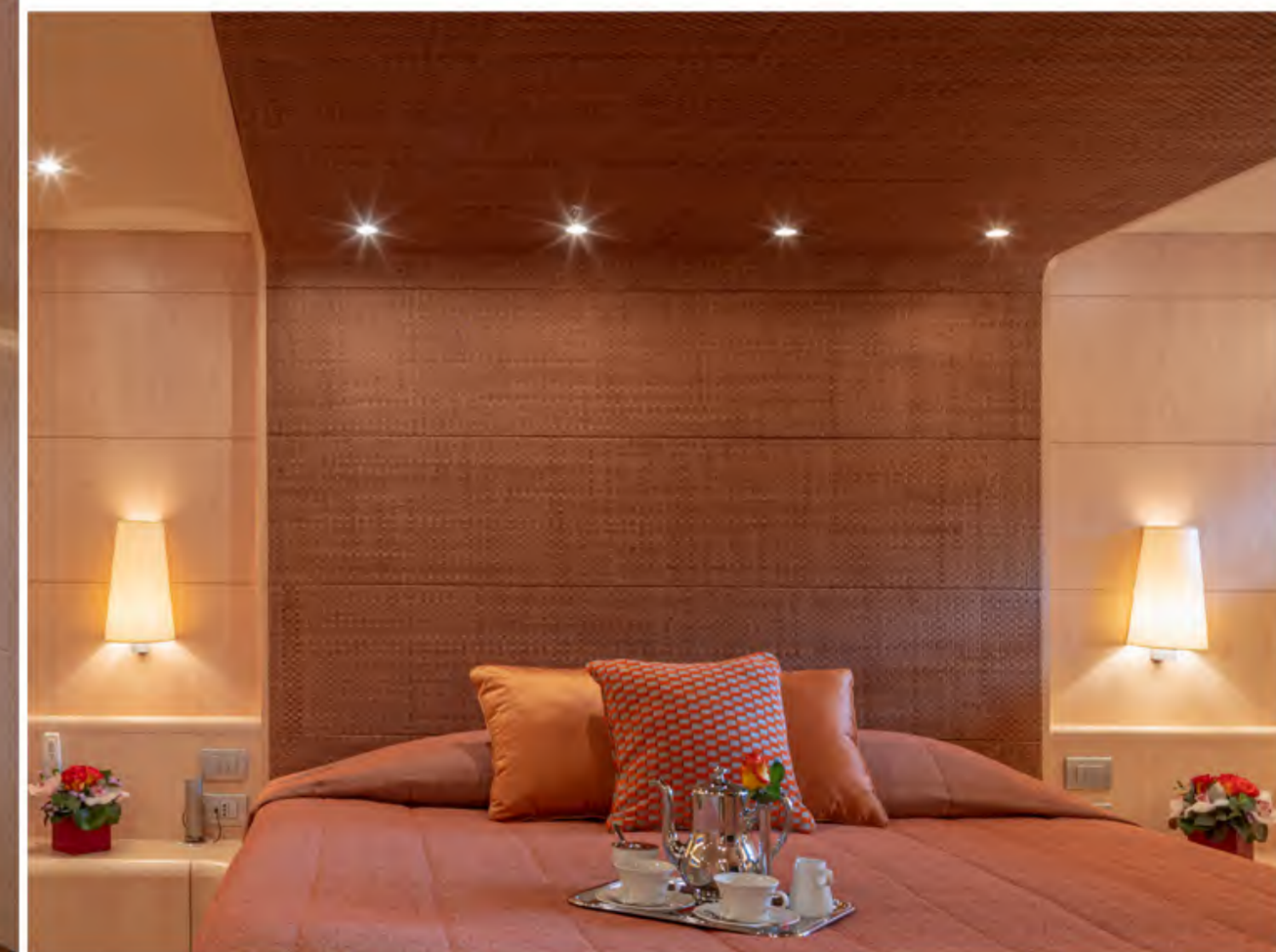
The spacious and stylish full beam Master cabin is located on the lower deck and features his & hers bathroom with Jacuzzi