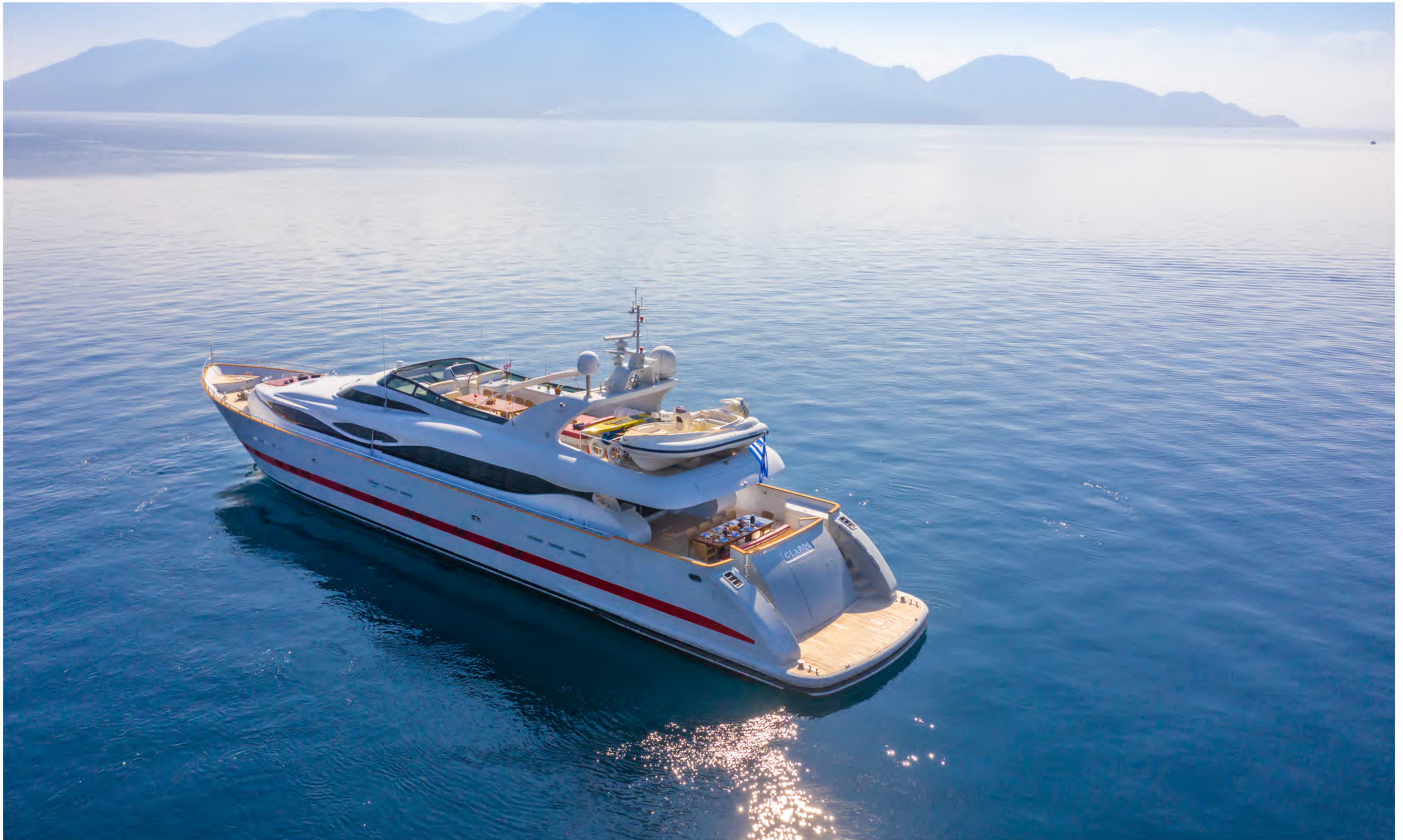
Glaros' exterior decks offer a variety of areas for dining, sunbathing, relaxing and enjoying the amazing views of the Greek scenery