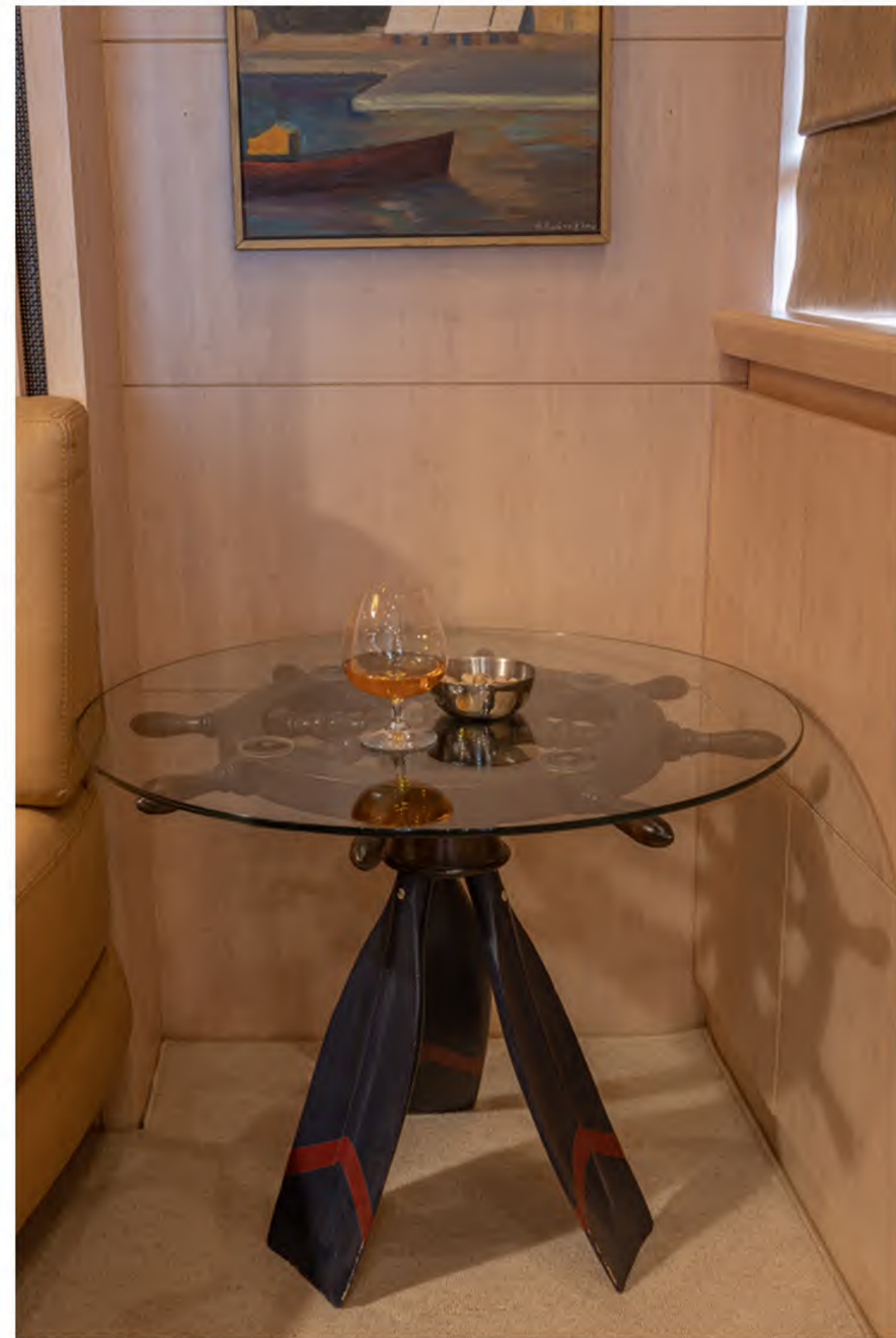
Glaros' panoramic windows allow the natural light to flow in and together with the light colored wooden walls create an airy and warm atmosphere ■