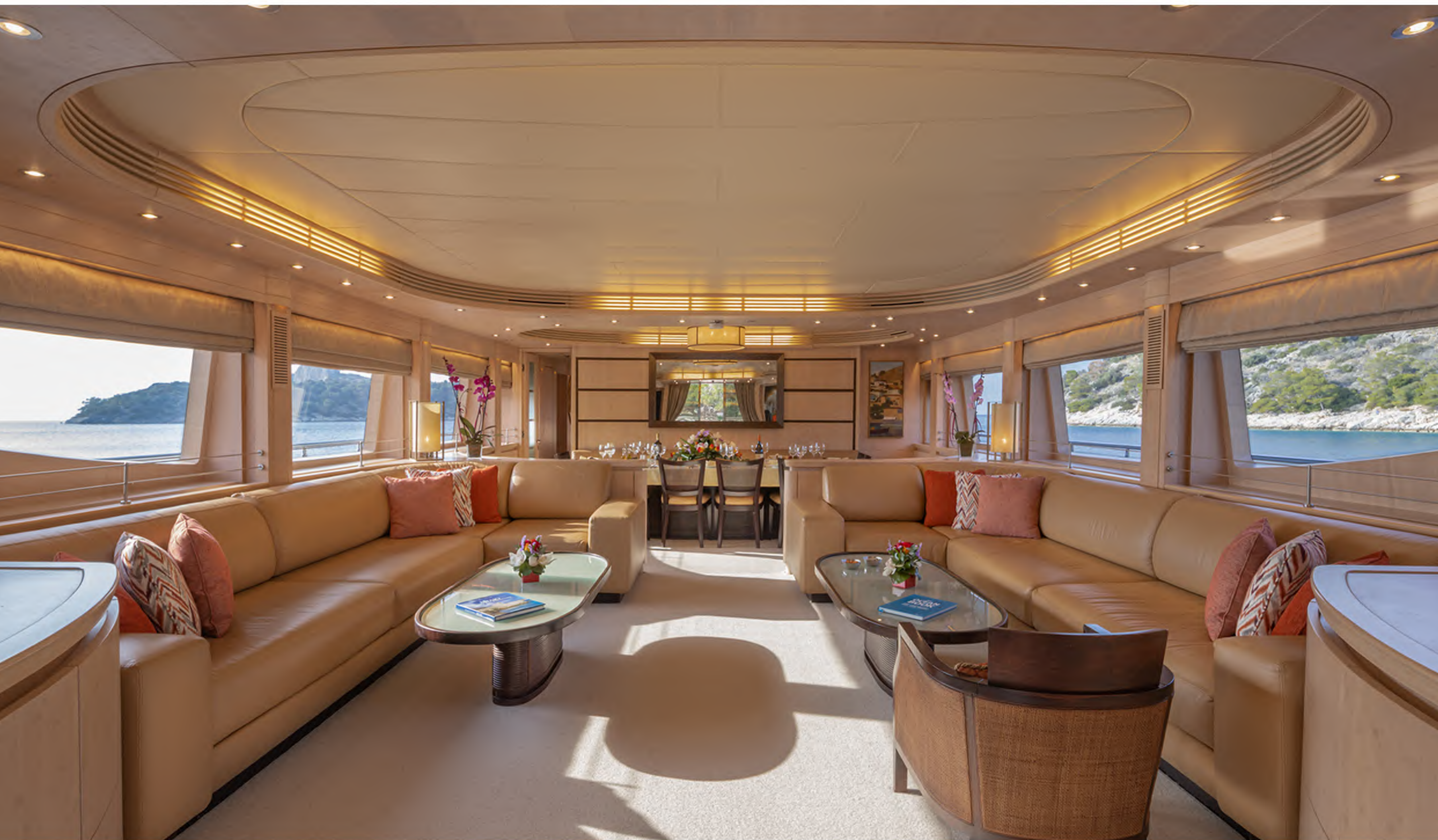
Elegant and contemporary design, featuring precious woods and luxurious leather furnishings