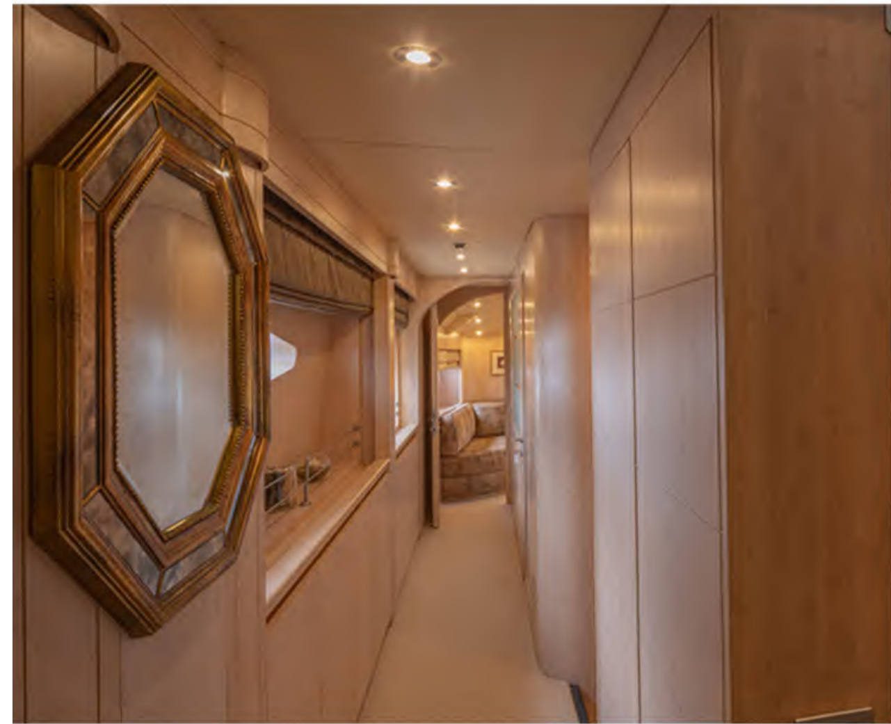
The VIP cabin on the main deck offers a luminous interior and ensuite facilities with Jacuzzi