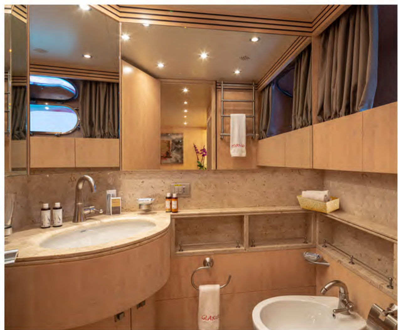
his & hers ensuite ■