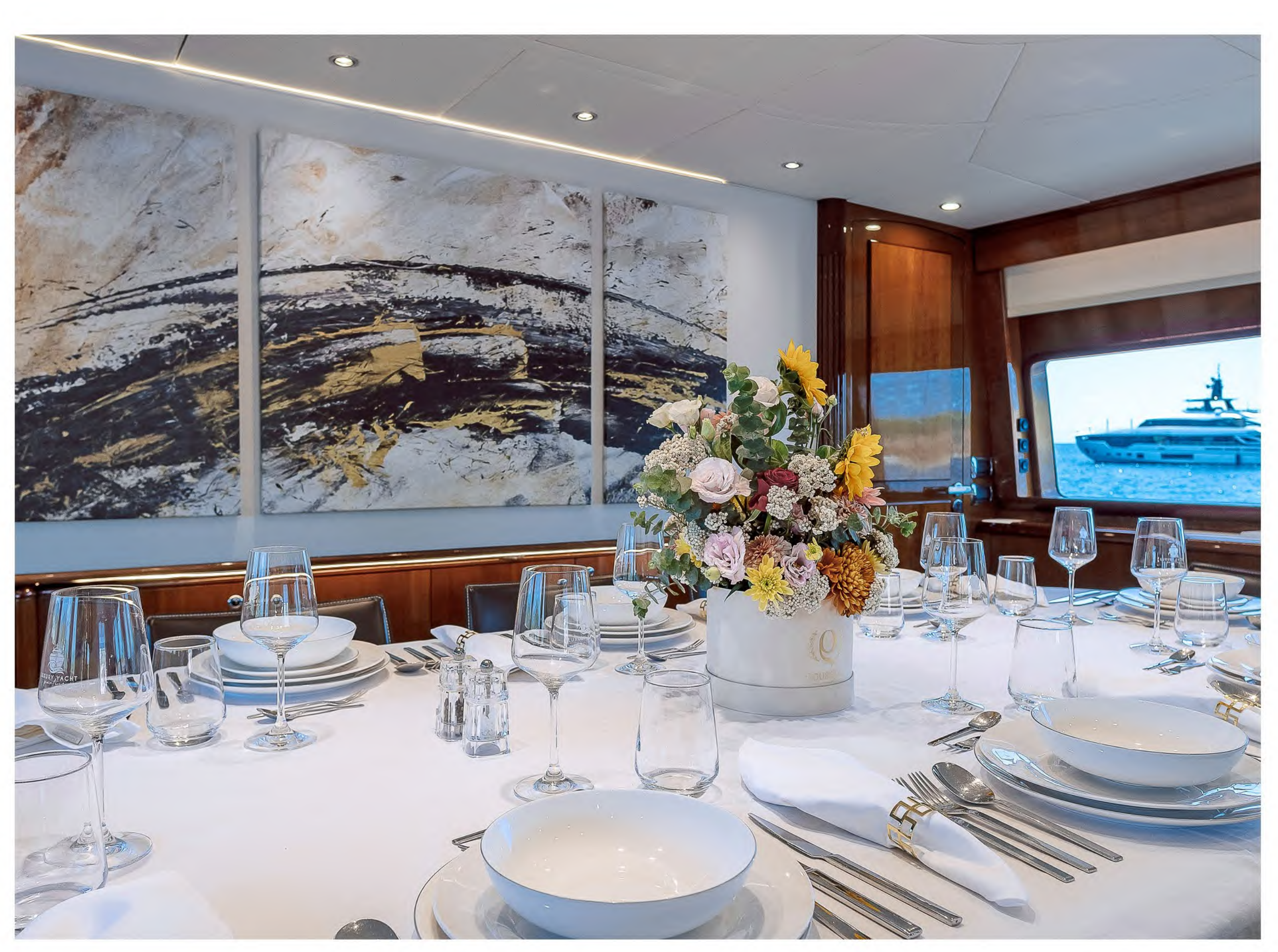
elegant salon & dining area offer a spacious, light-filled setting with refined furnishings, creating a perfect ambiance for both relaxation & sophisticated dining