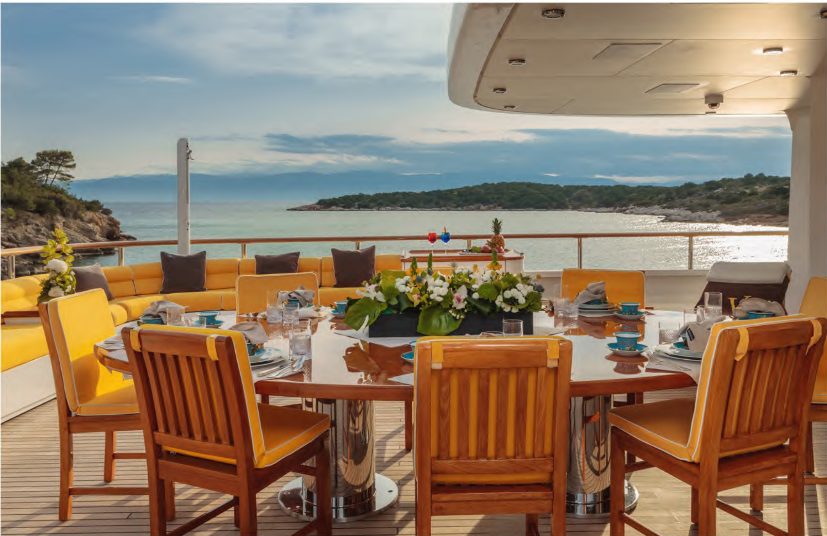
■ luxury in every detail