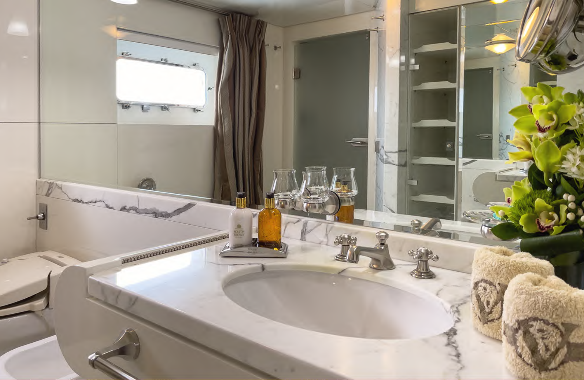
VIP cabin ensuite