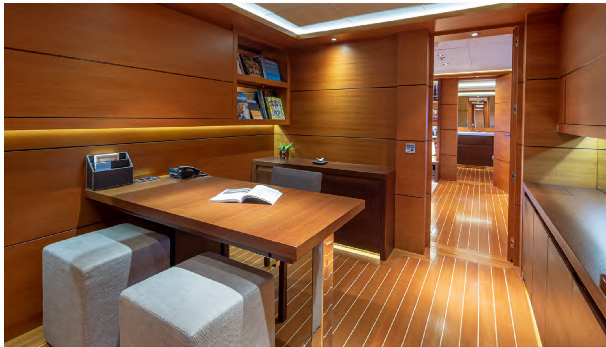
VIP Cabin walk in closet and office area