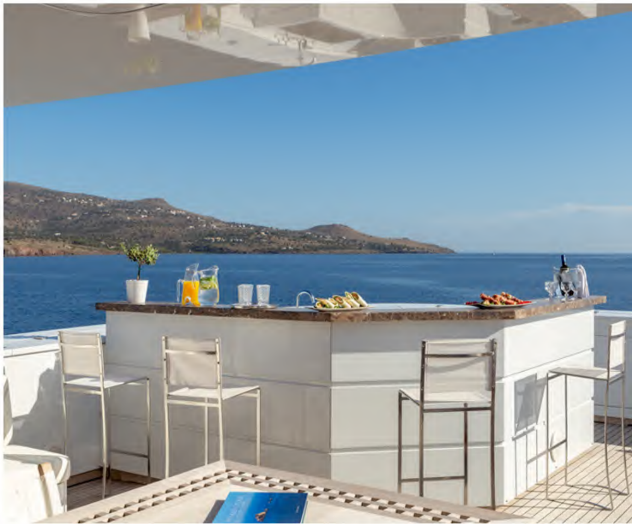
The magnificent and expansive sundeck hosts a large Jacuzzi, sunbathing area , beautiful lounge area , bar and al fresco dining able to accommodate up to 24 guests ■