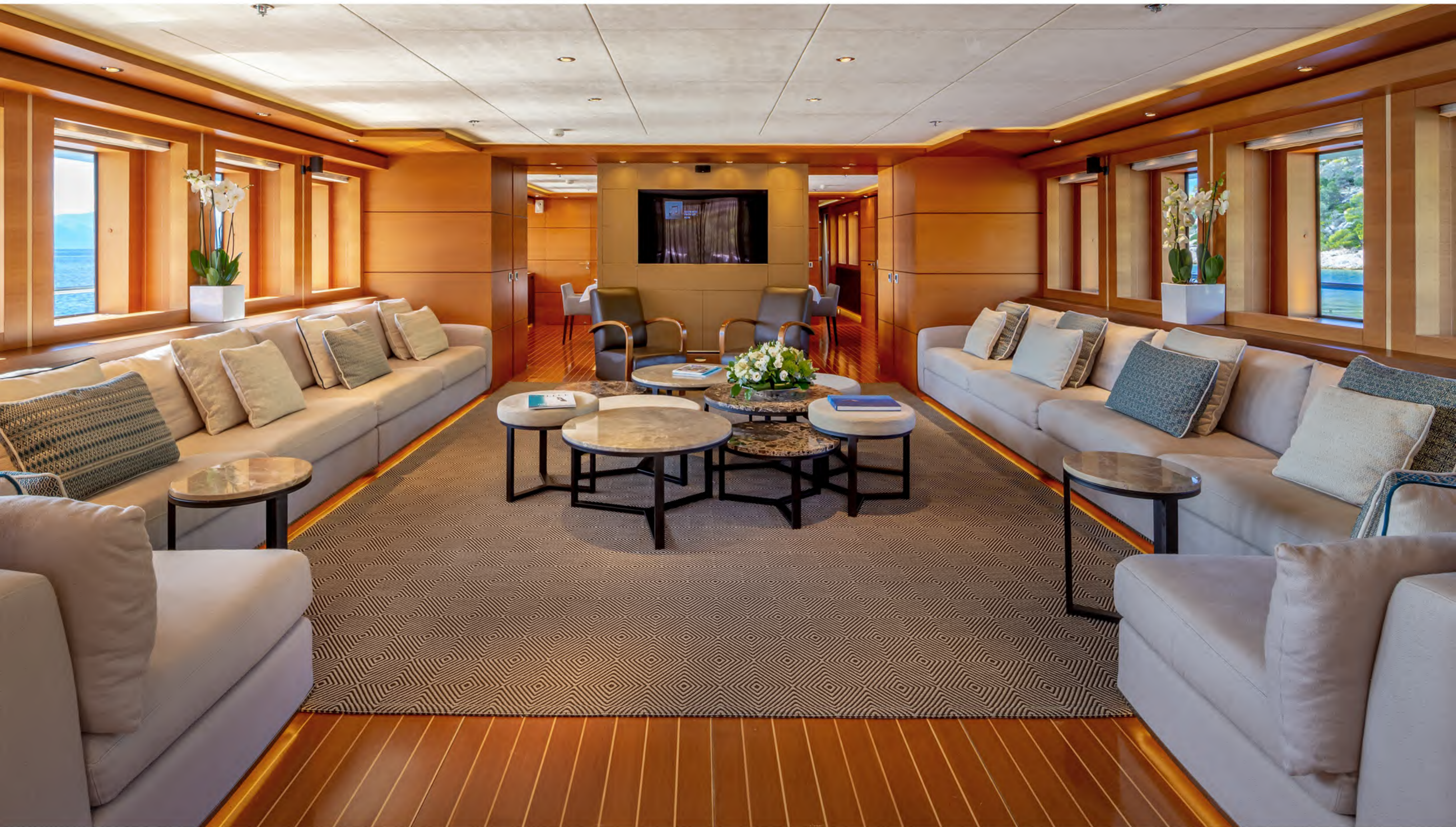
The choice of a contemporary, almost minimalist design contrasting with exquisitely tasteful furniture makes ZALIV III unique and original