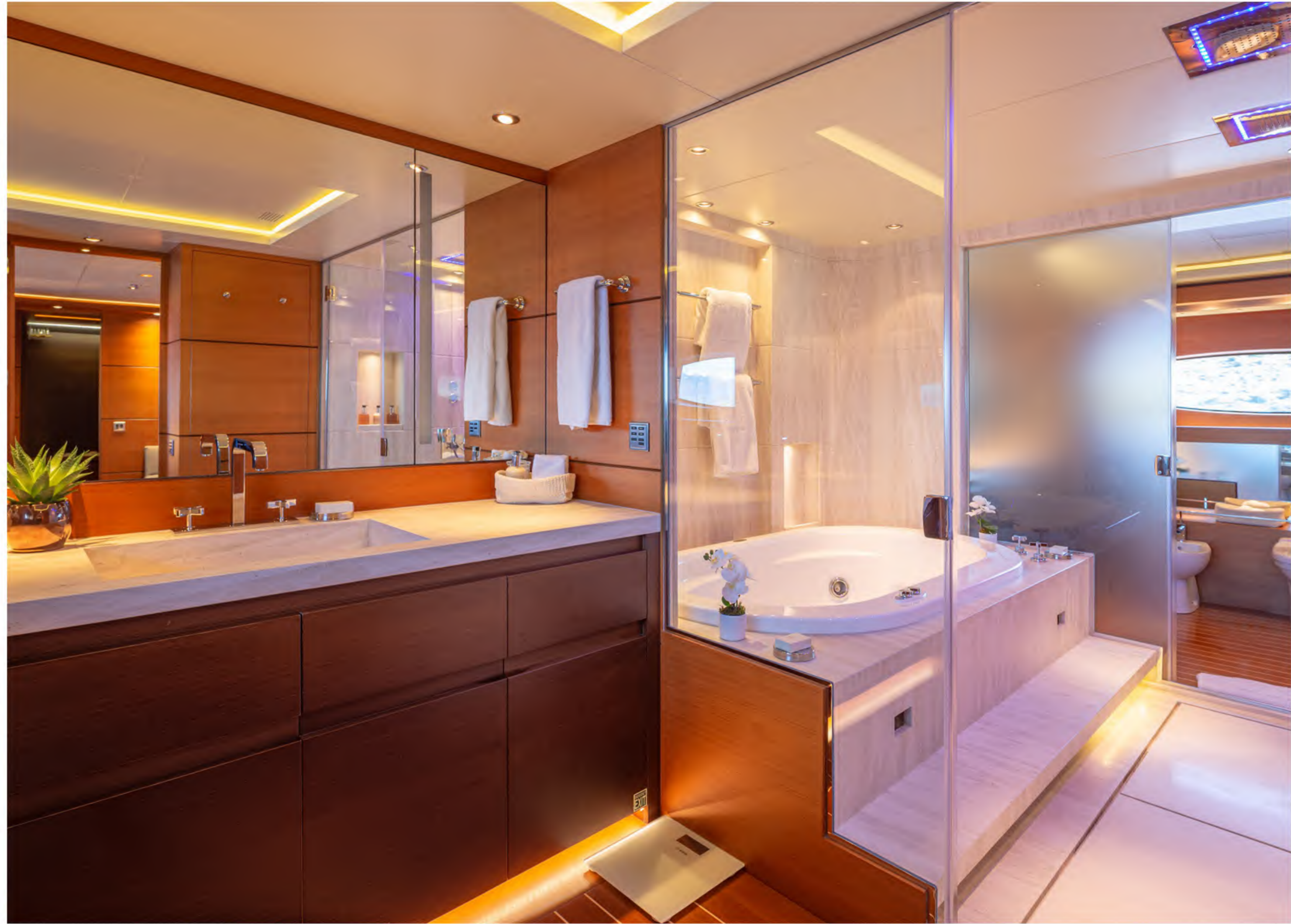
VIP his & hers bathroom, jacuzzi, shower & steam bath ■