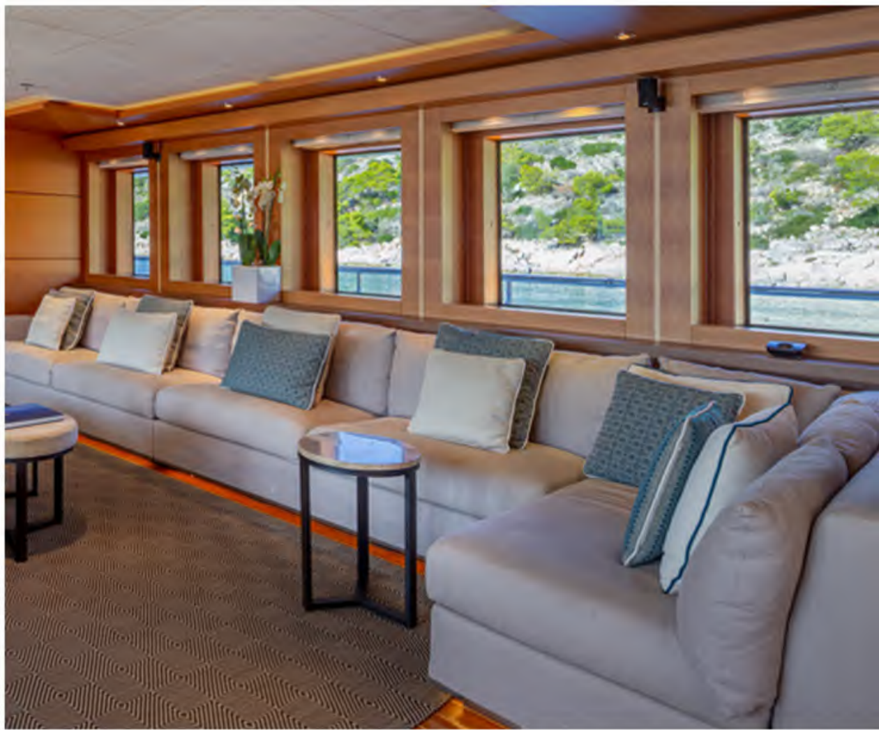
Fine woods incorporating with luxury materials and aesthetic lighting elements are giving ZALIV III a fabulous sense of space