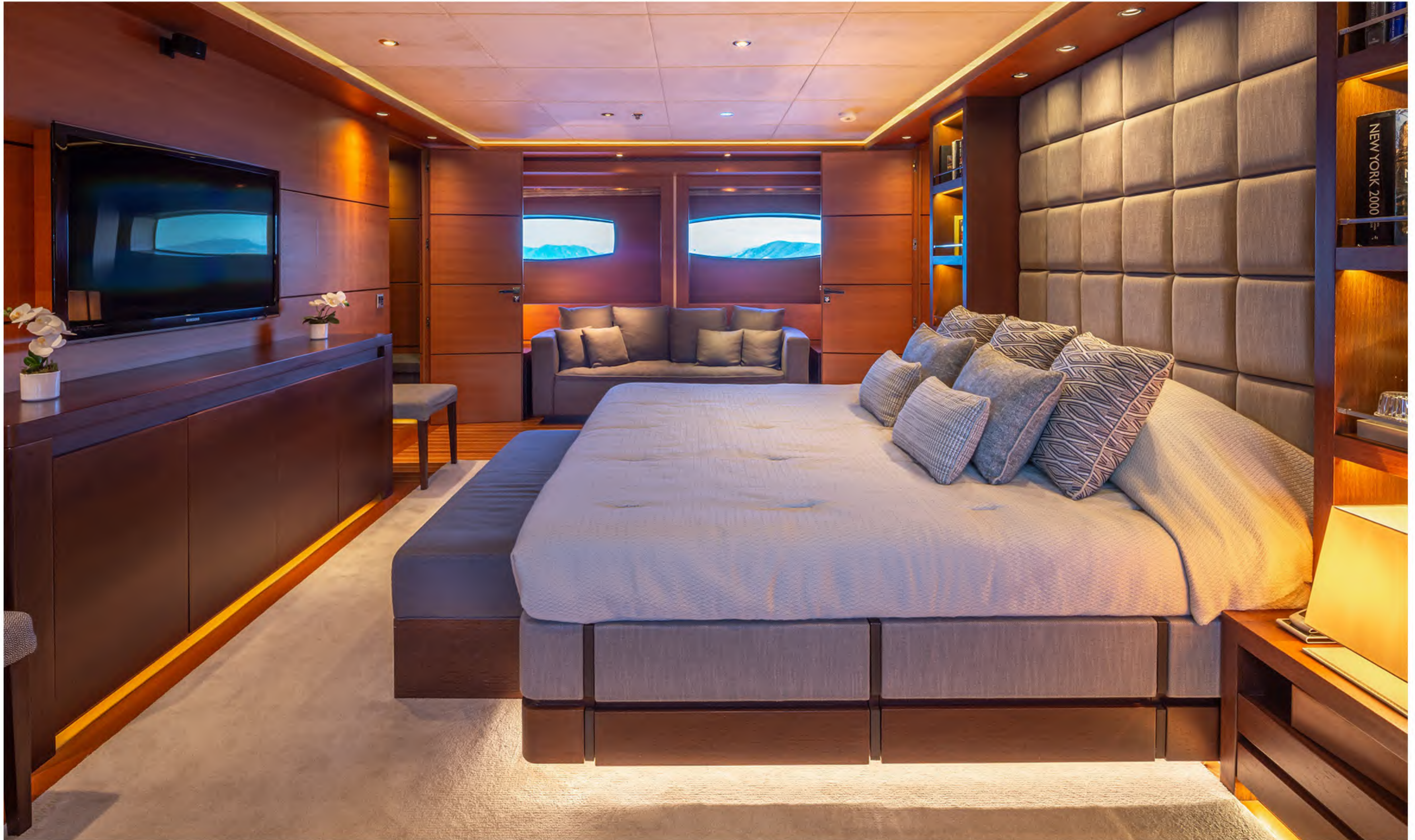
The beautiful full beam VIP cabin, with a king size bed, is located on the main deck and is like a second Master