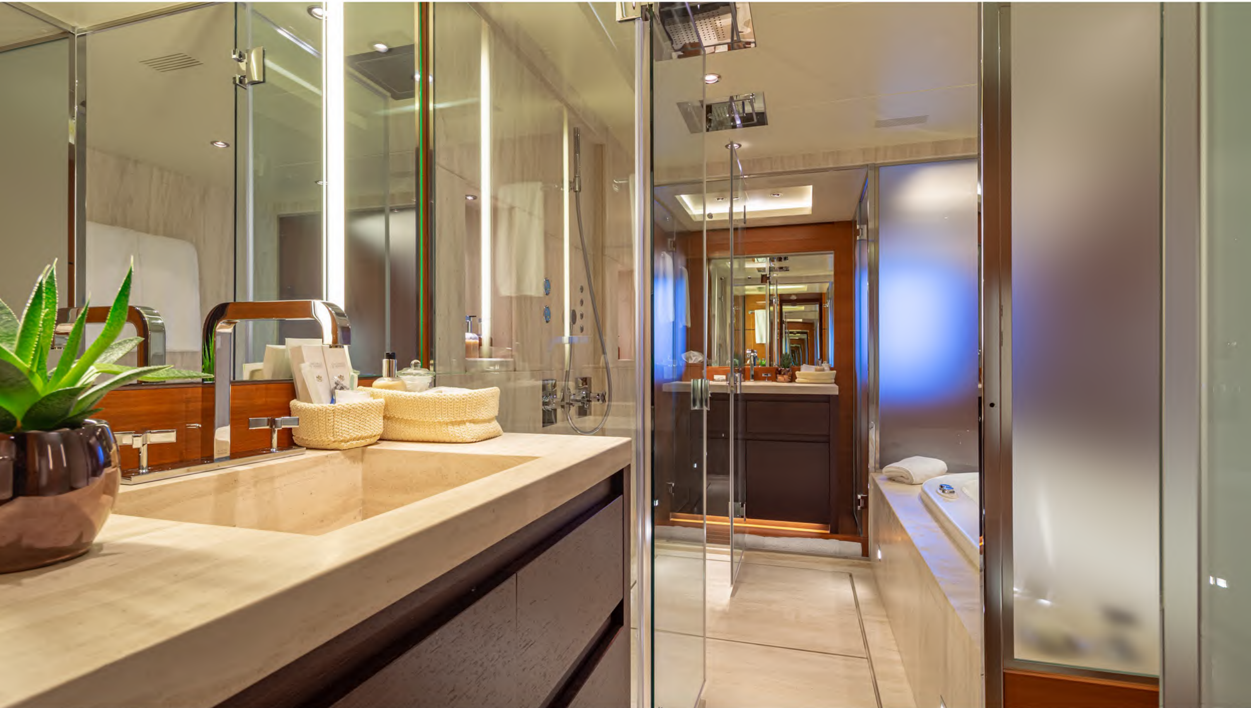
■ master bathroom