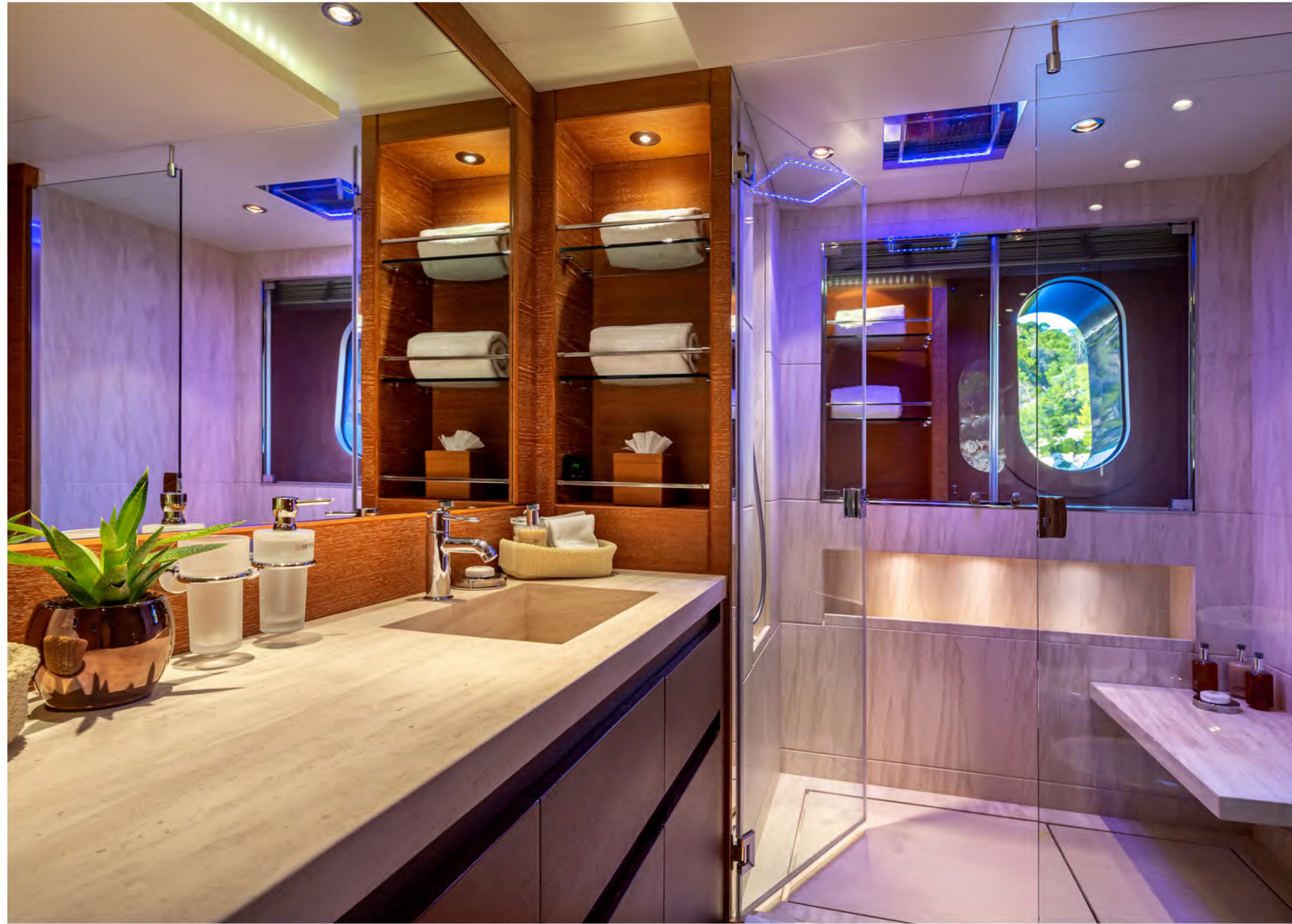
Two elegant double cabins are located on the lower deck, with a queen size bed and ensuite facilities with shower & steam bath