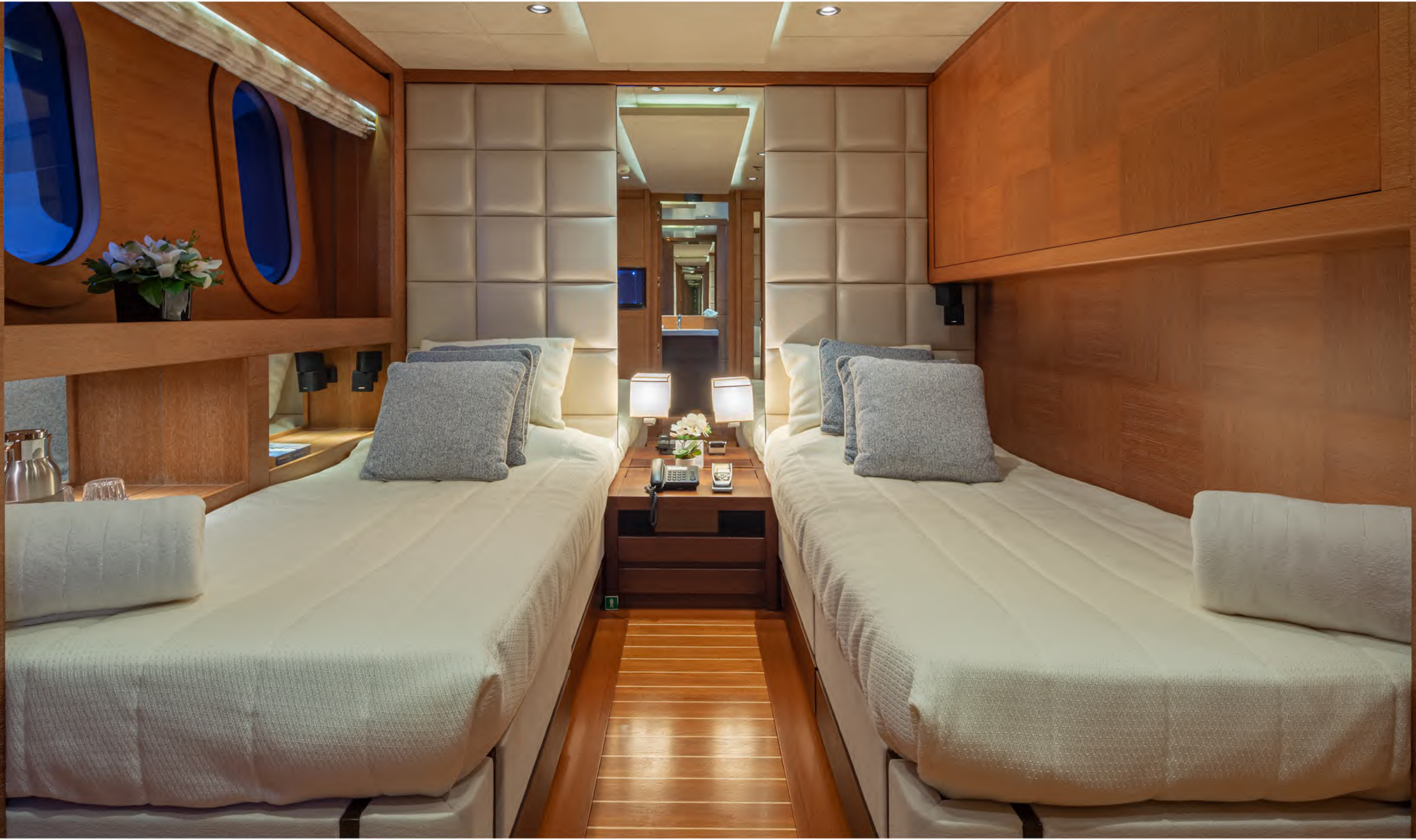
■ twin cabin