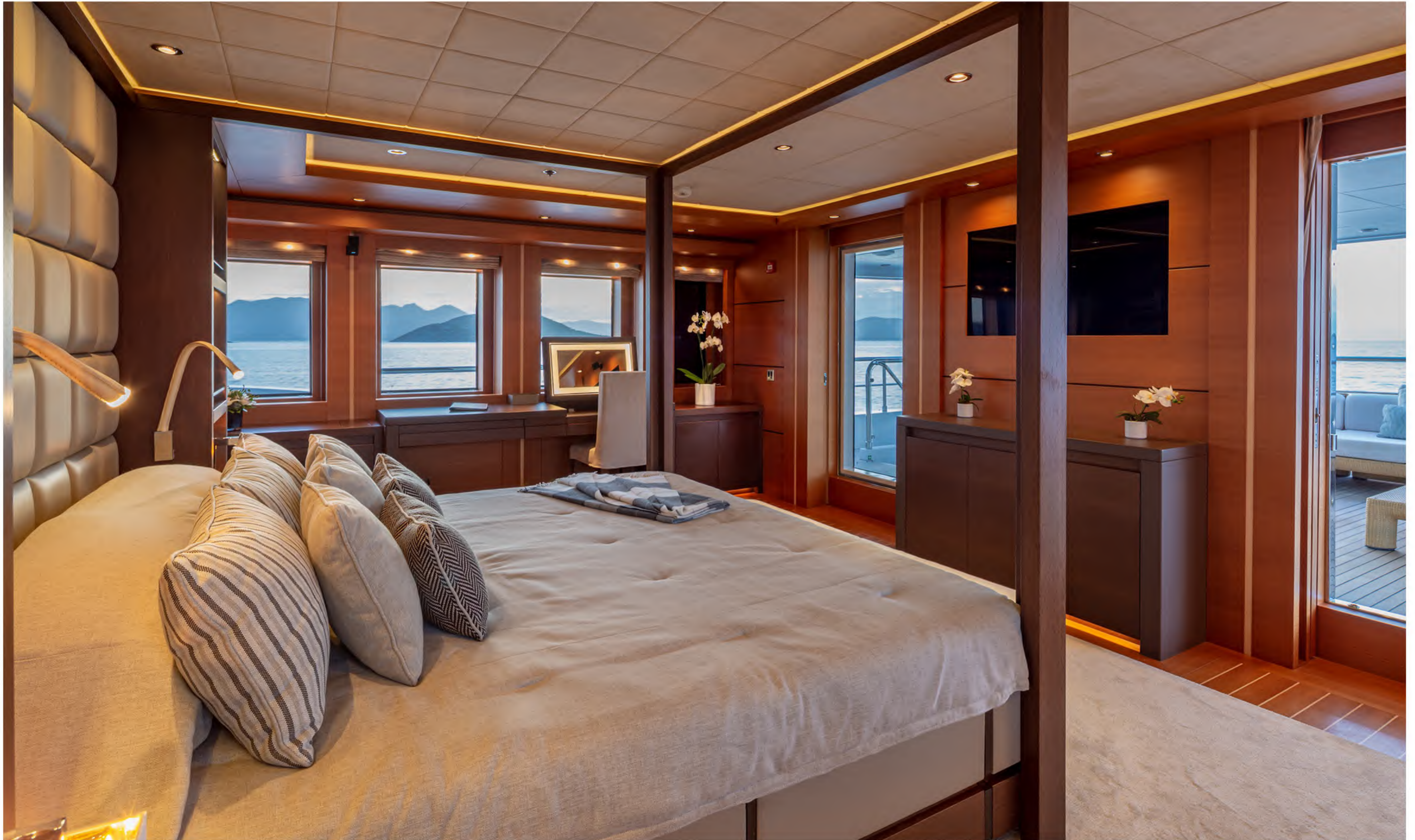
The sophisticated full beam Master Cabin is located on the upper deck offering unparalleled views & privacy