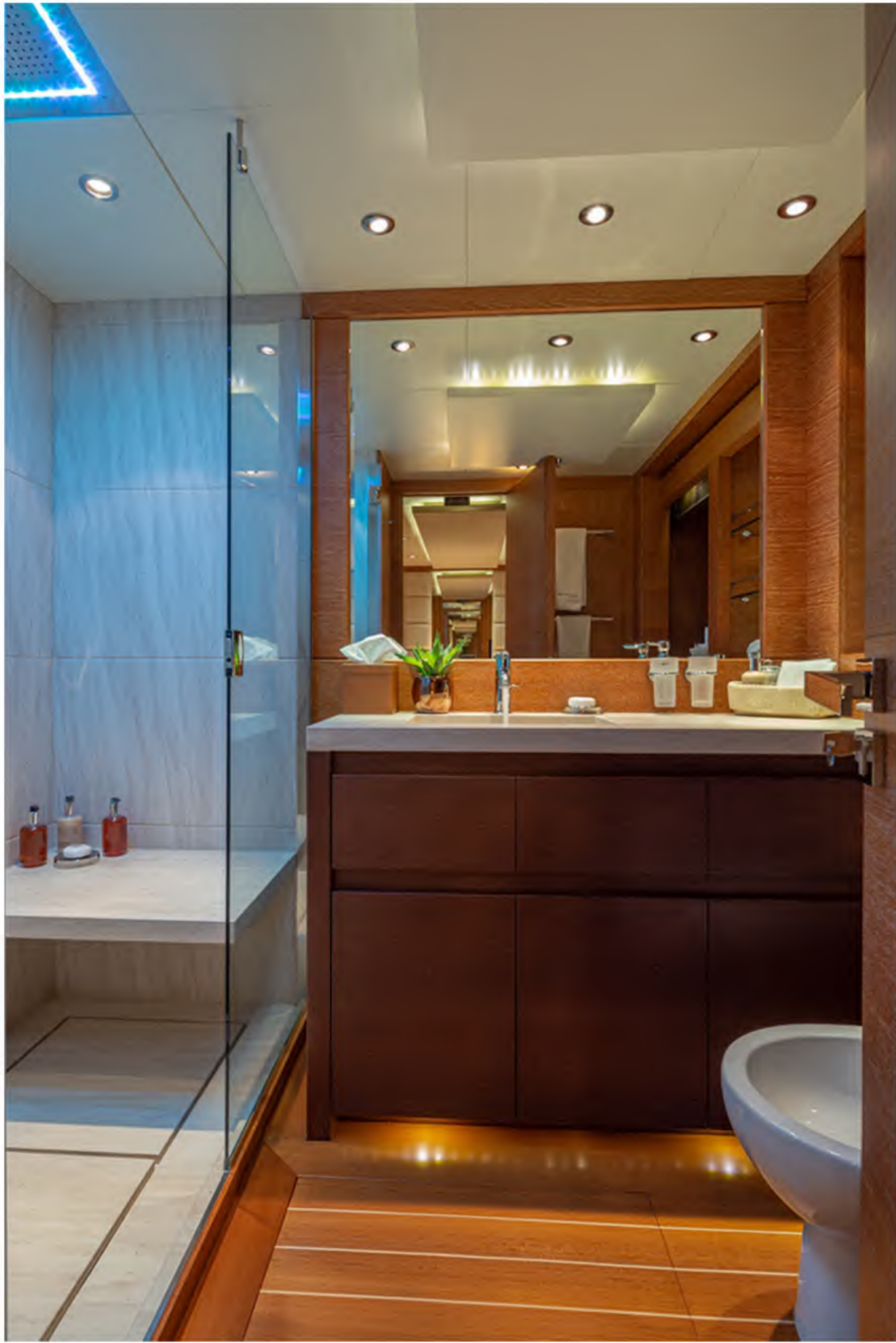
The two spacious twin cabins located on the lower deck offer a pullman berth each and ensuite facilities