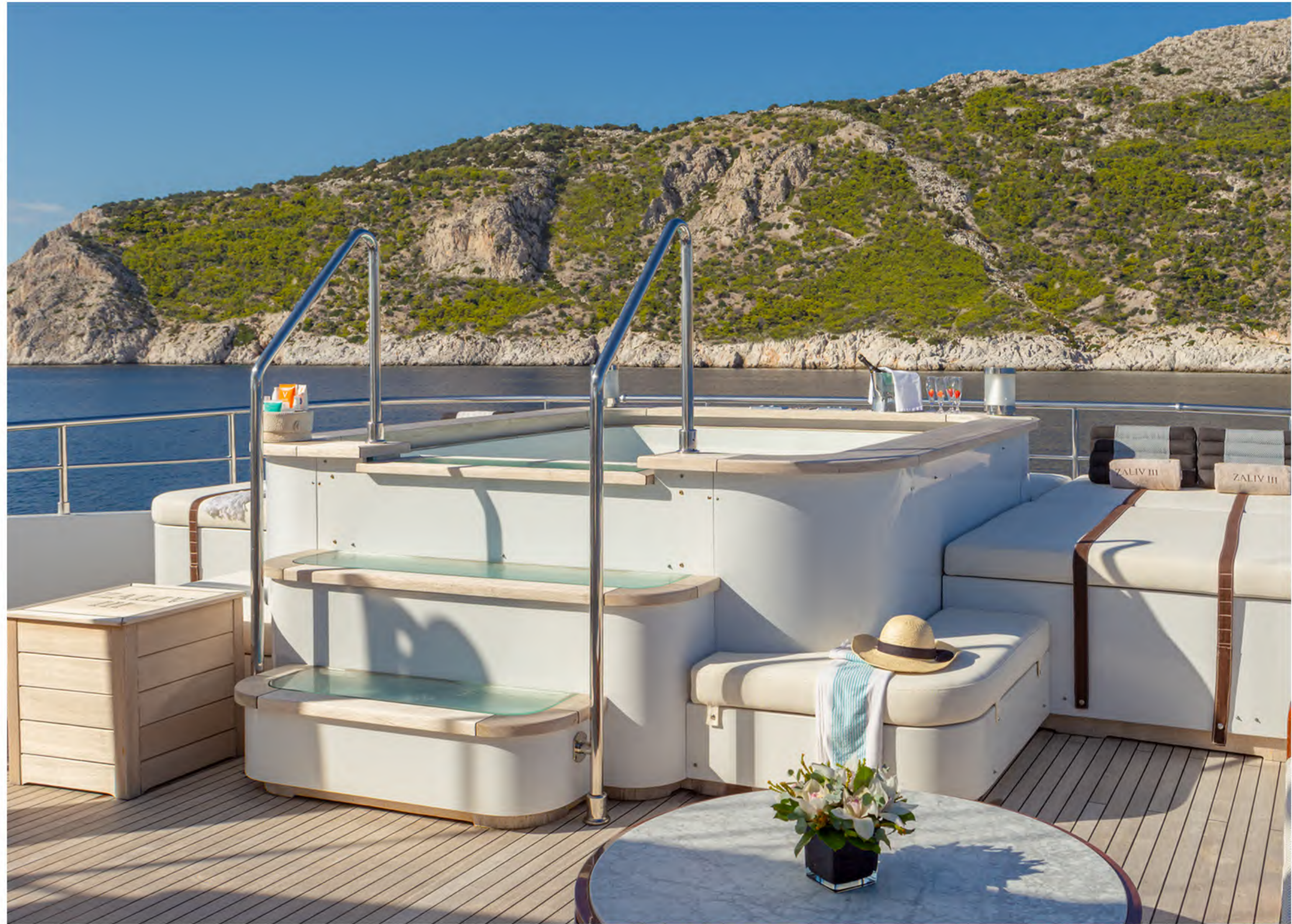
The large jacuzzi is the ultimate place for relaxation providing spectacular views