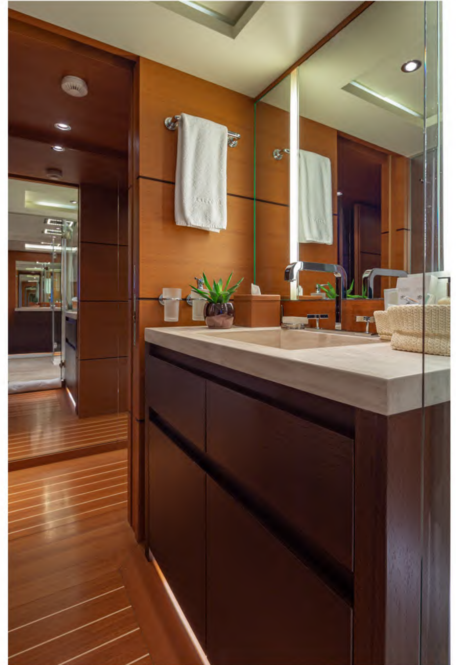
His and Hers en suite facilities, jacuzzi, shower & steam bath