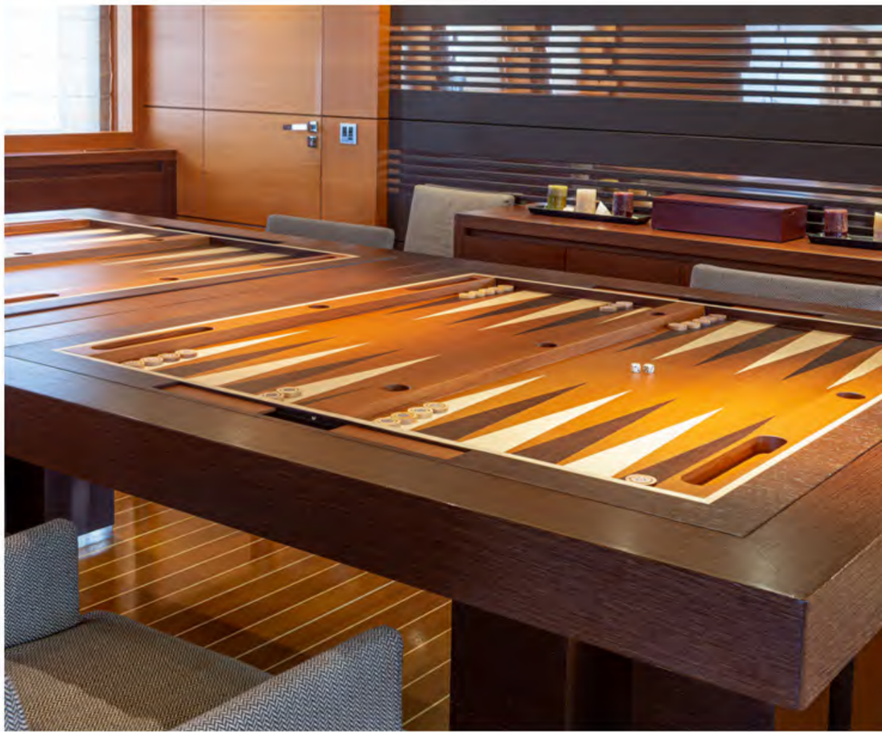
The dining table at the main deck can be converted into a backgammon table ■