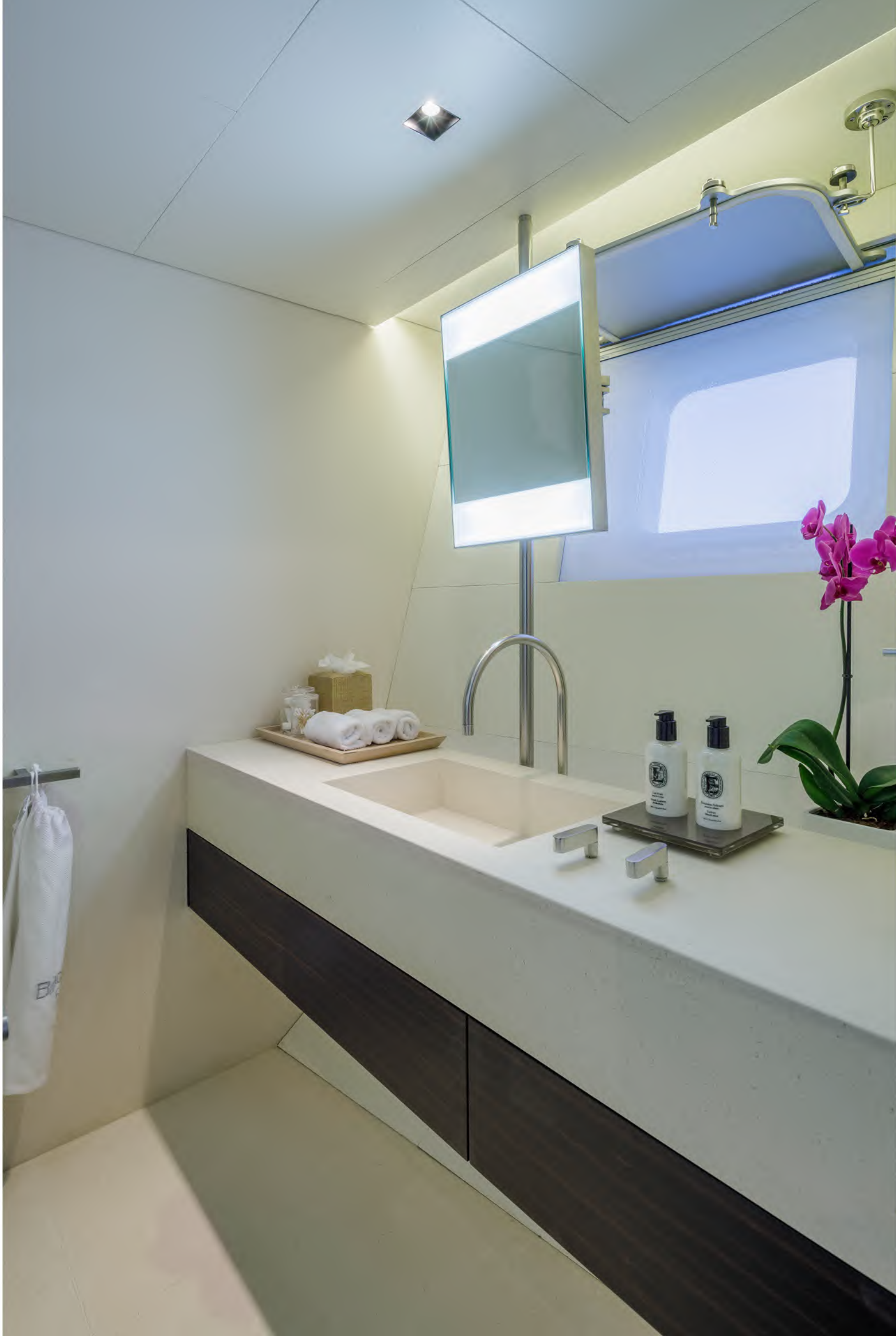
■ twin cabin ensuite