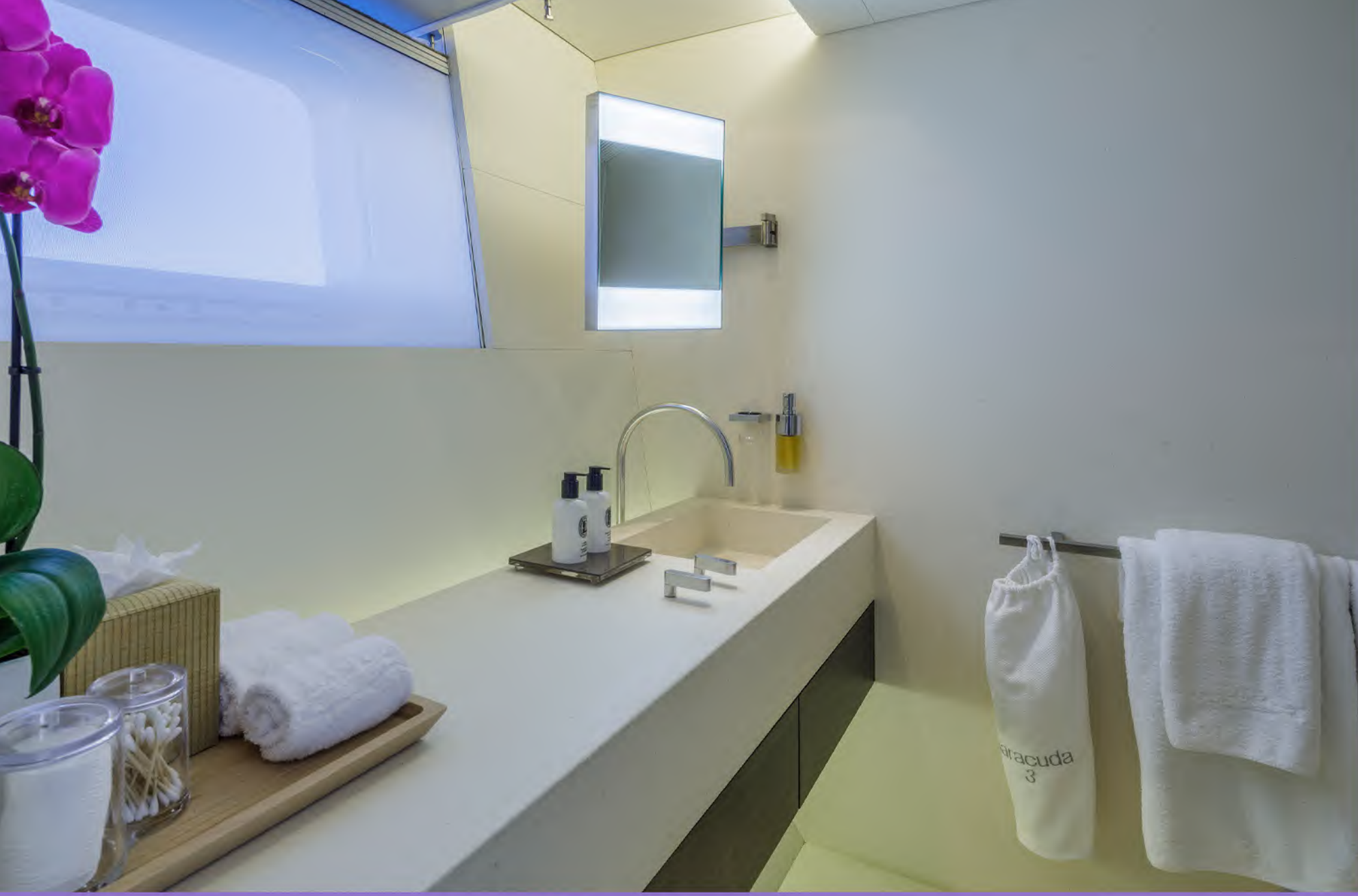
■ VIP cabin ensuite