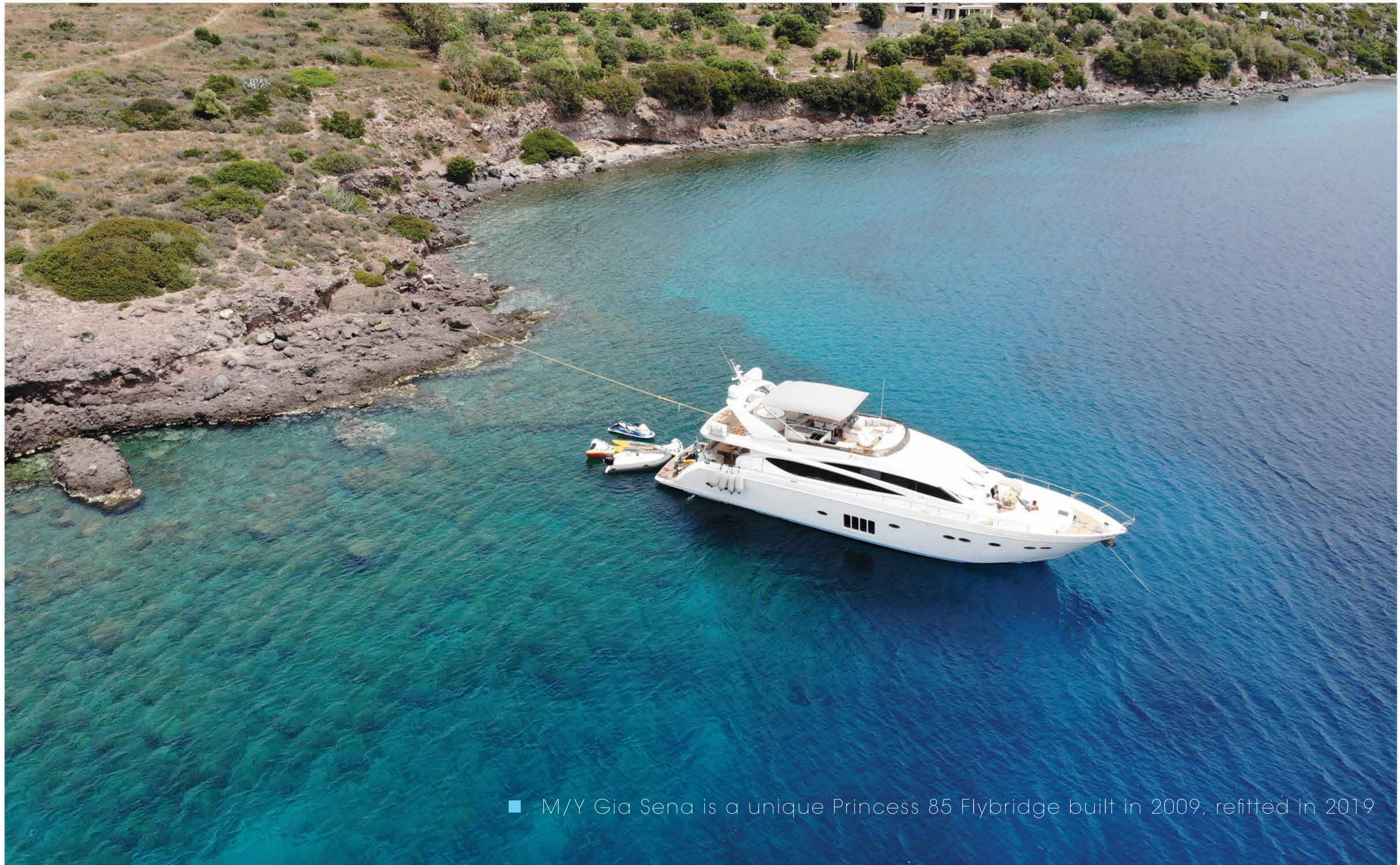
■ M/Y Gia Sena is a unique Princess 85 Flybridge built in 2009, refitted in 2019