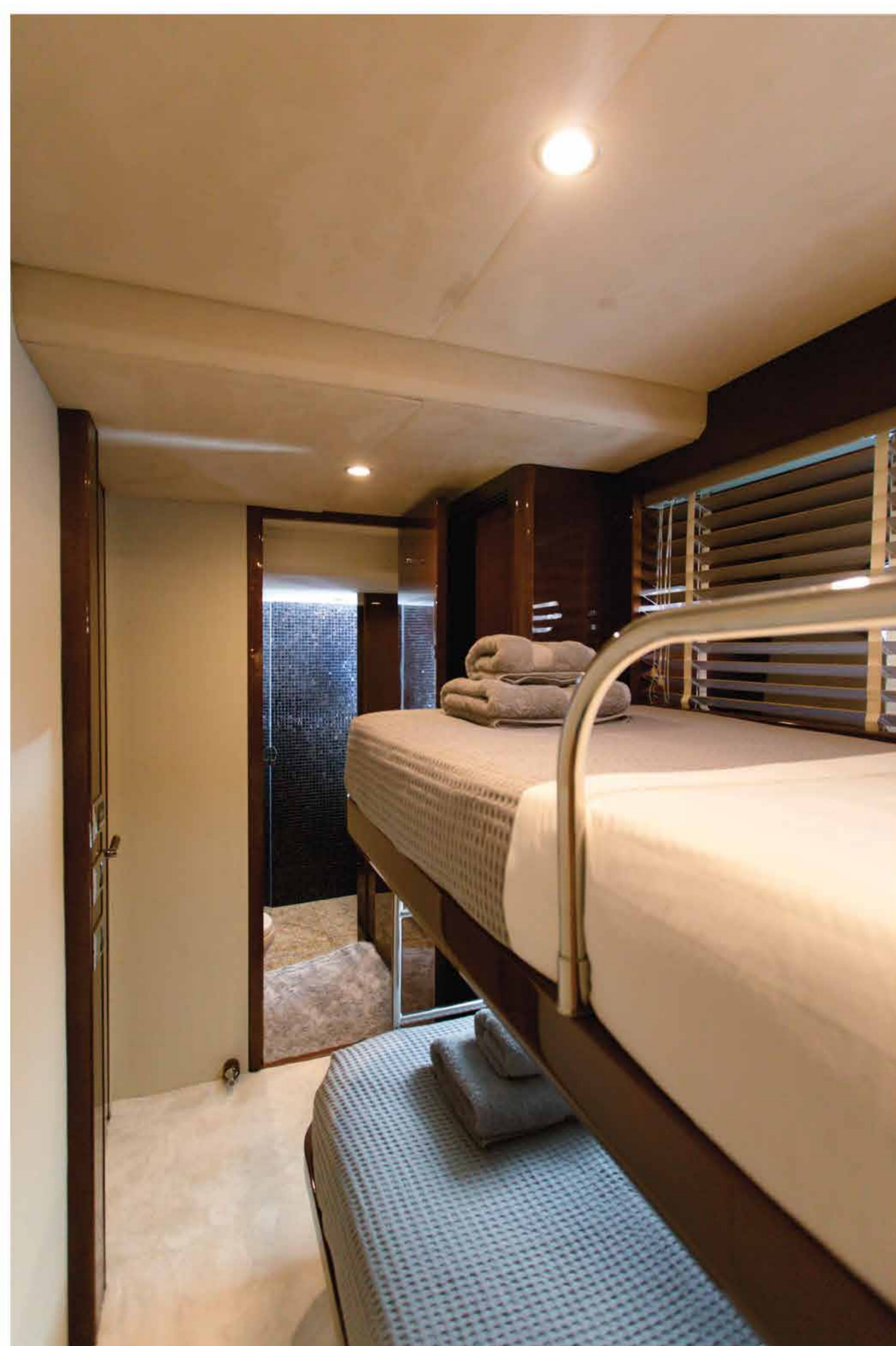
■ up & down cabin & ensuite