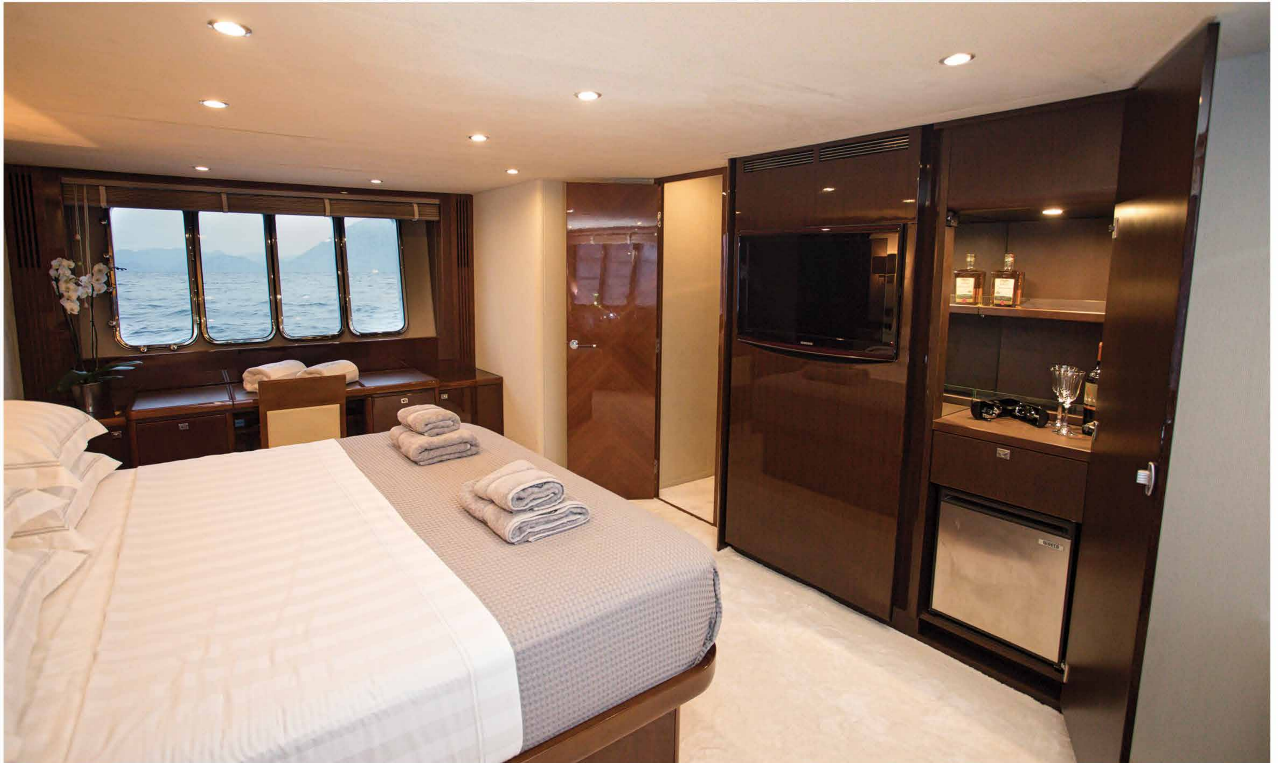
The full beam Master Cabin is the epitome of elegance offering the feeling of relaxation ■