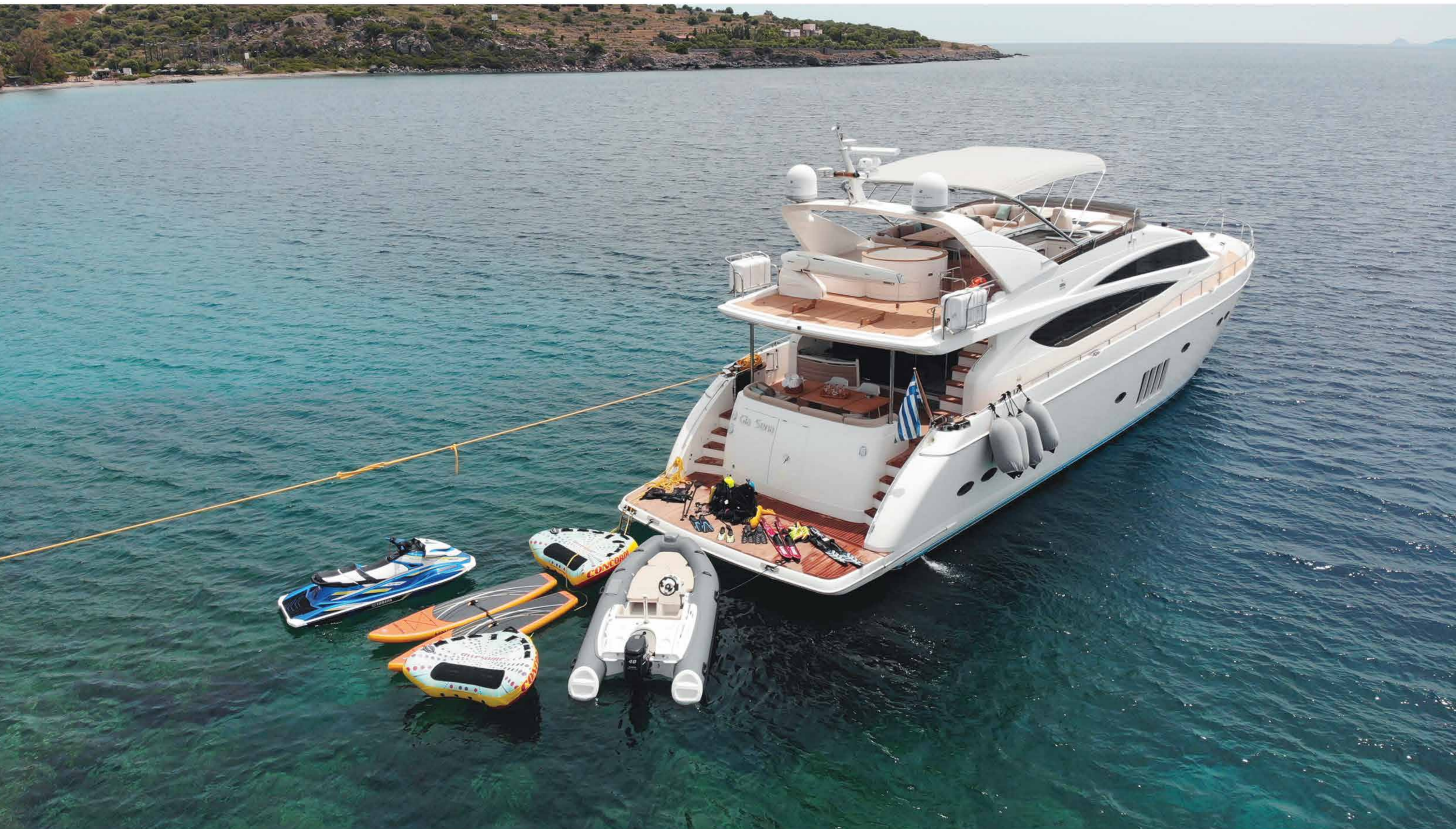
The hydraulic swimming platform offers access to the biggest natural infinity pool ■