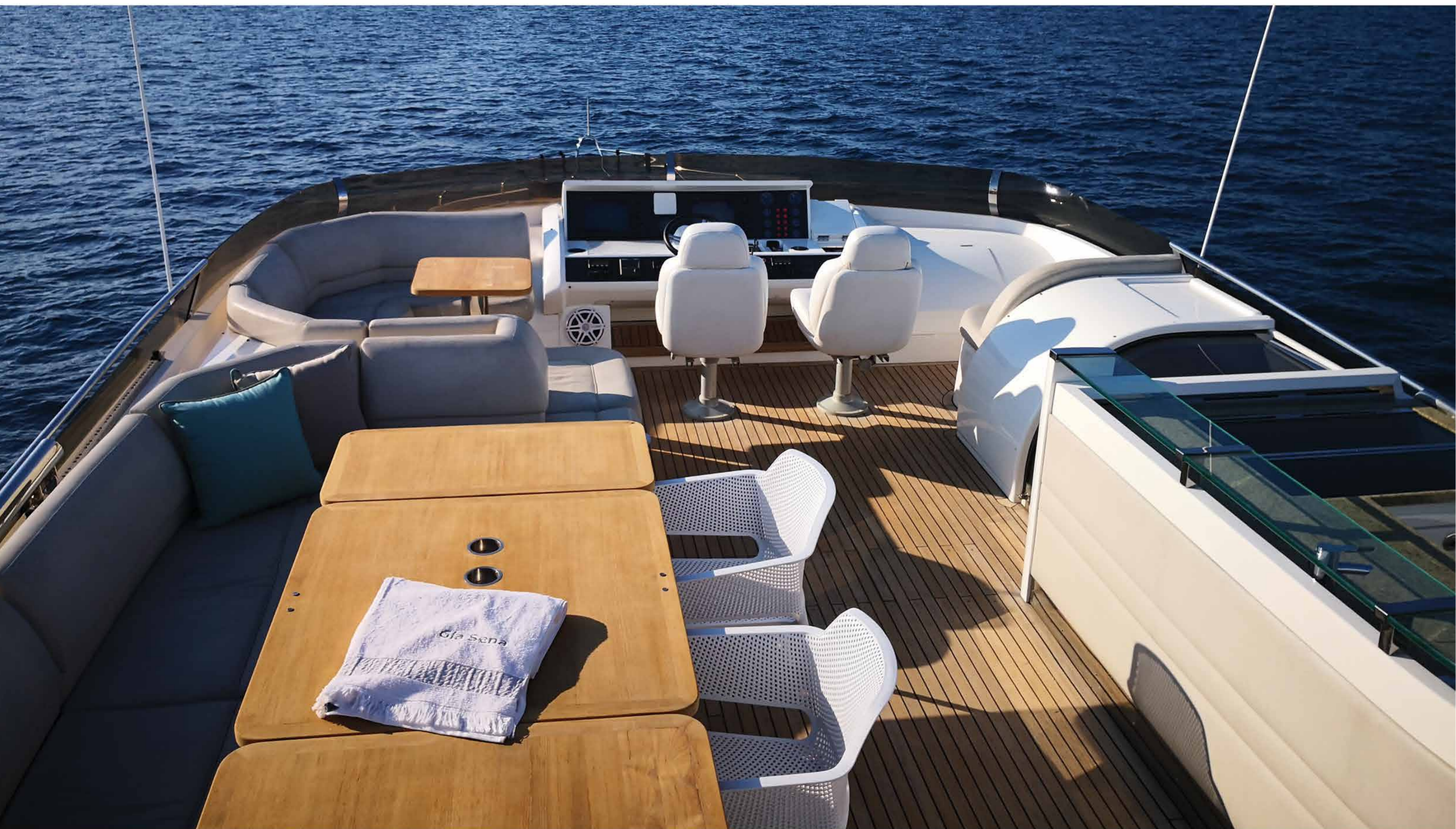
The flybridge is an alluring invitation for outdoor entertainment with a breathtaking rooftop dining area with bar, a sun bathing area and a Jacuzzi