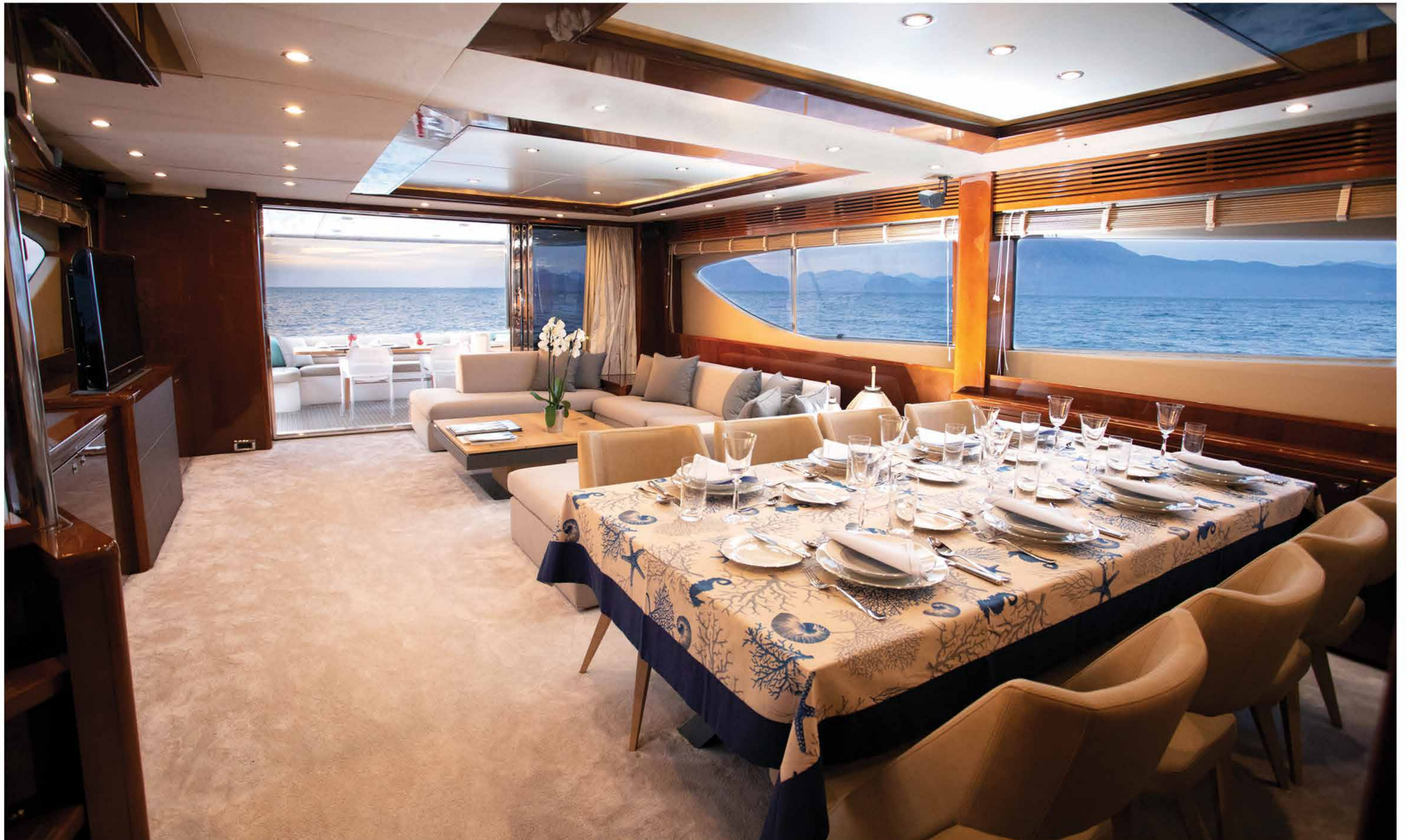
Wide windows invite the sea views and air indoors ■