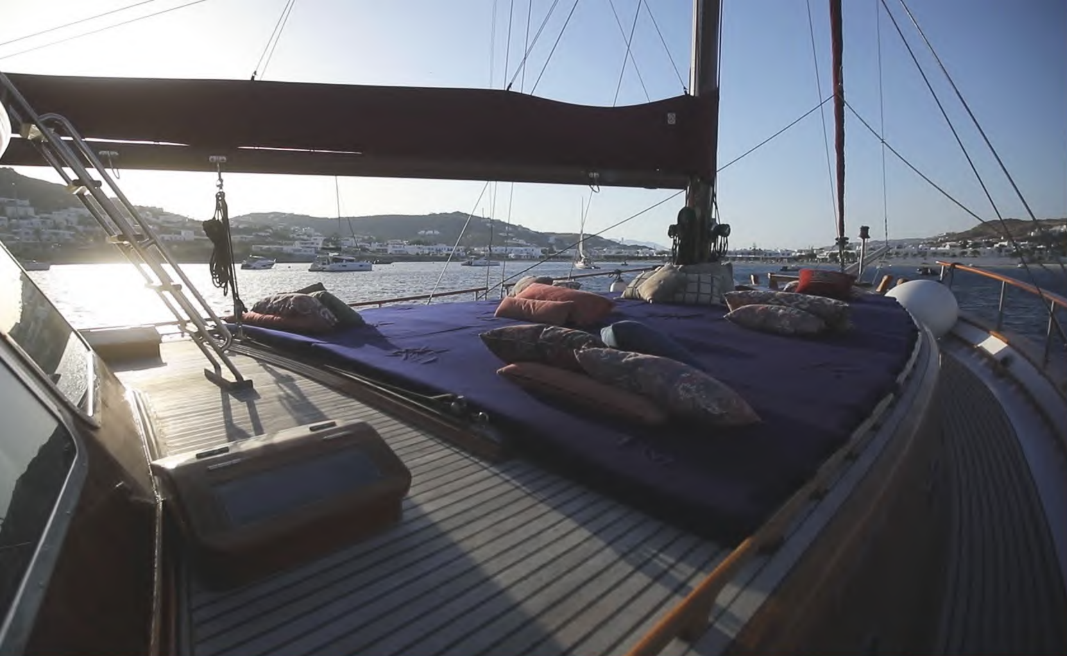
■ bow - sunbathing area