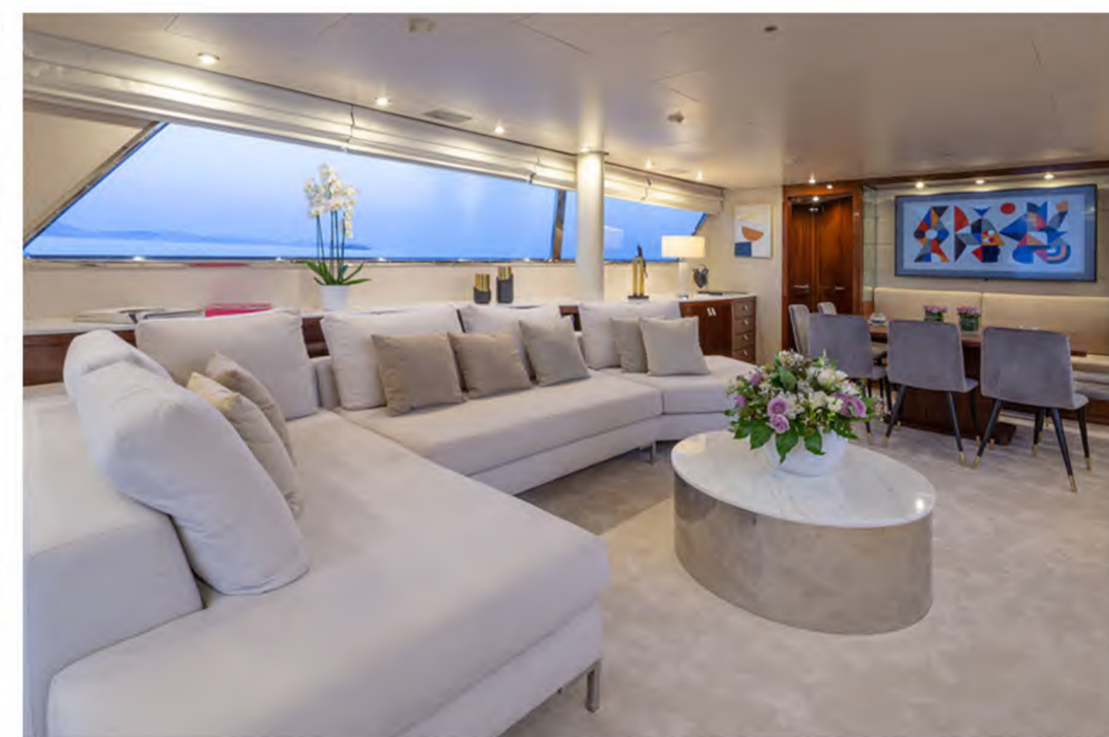
■ Completely refitted in 2018, the main salon offers a luxurious and comfortable living space