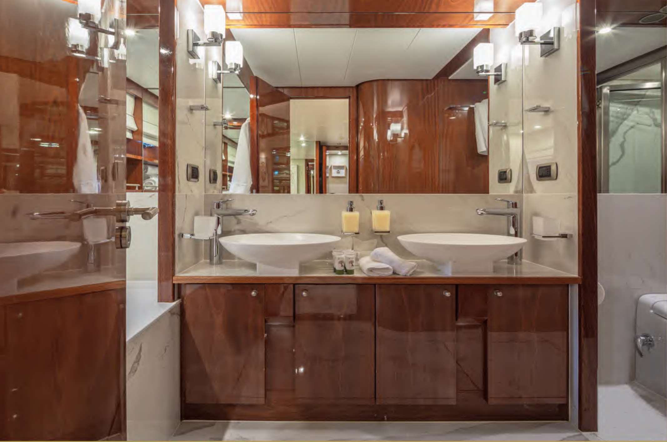
■ master bathroom