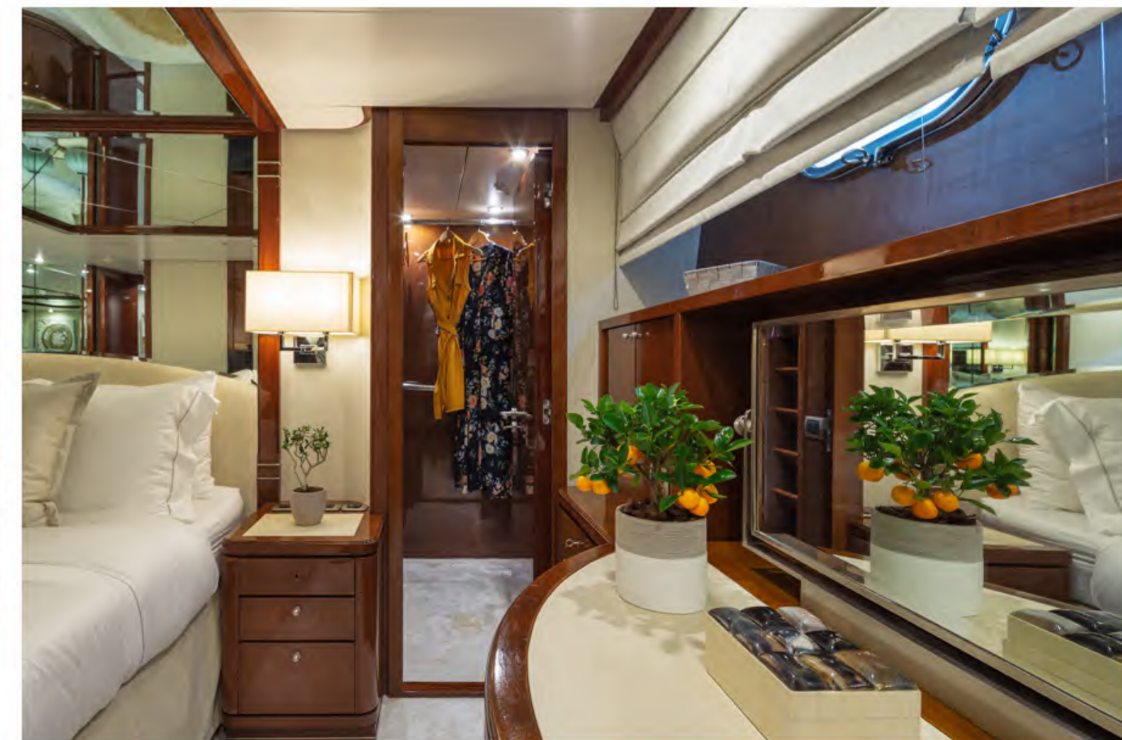
■ Gorgeous timber combined with deluxe fabrics make Master Cabin a superb place for relaxation