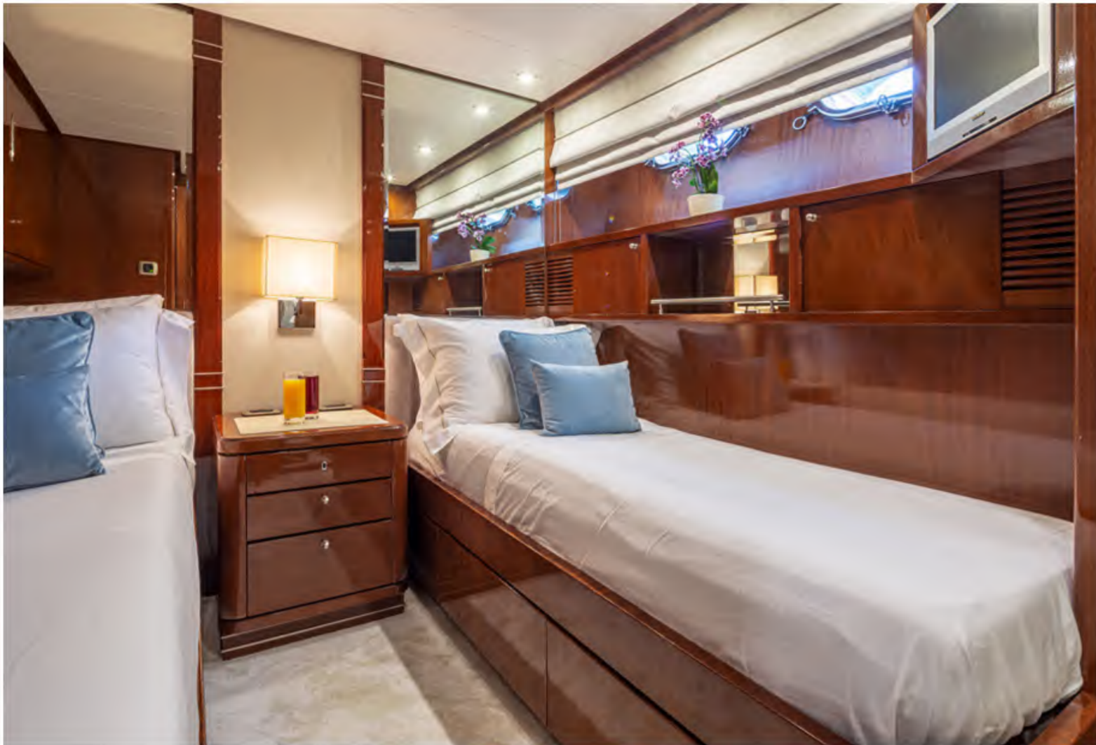
■ twin cabin