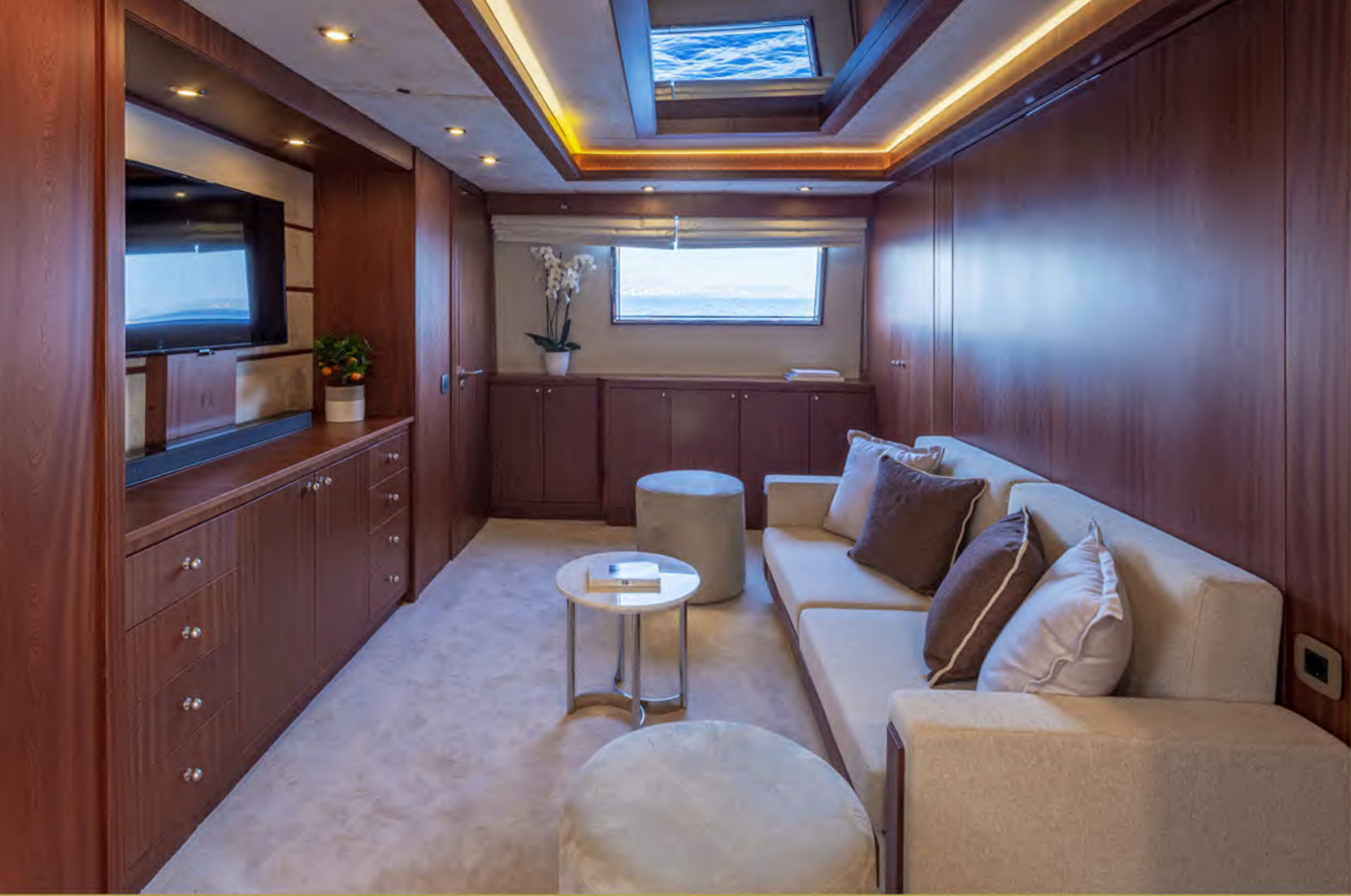
■ Playroom | Convertible to Double Cabin