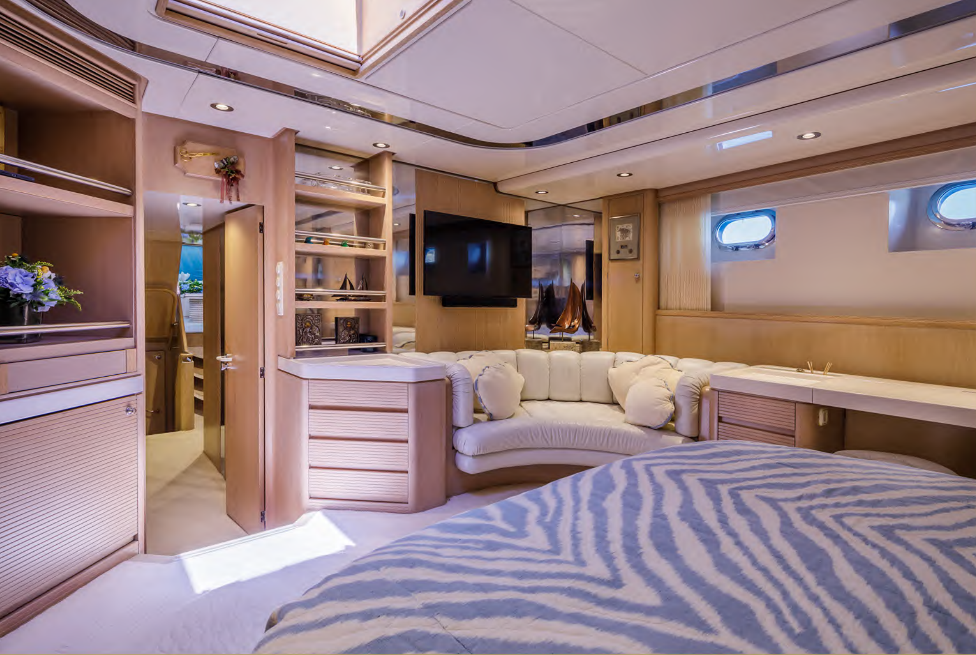
■ master cabin ensuite