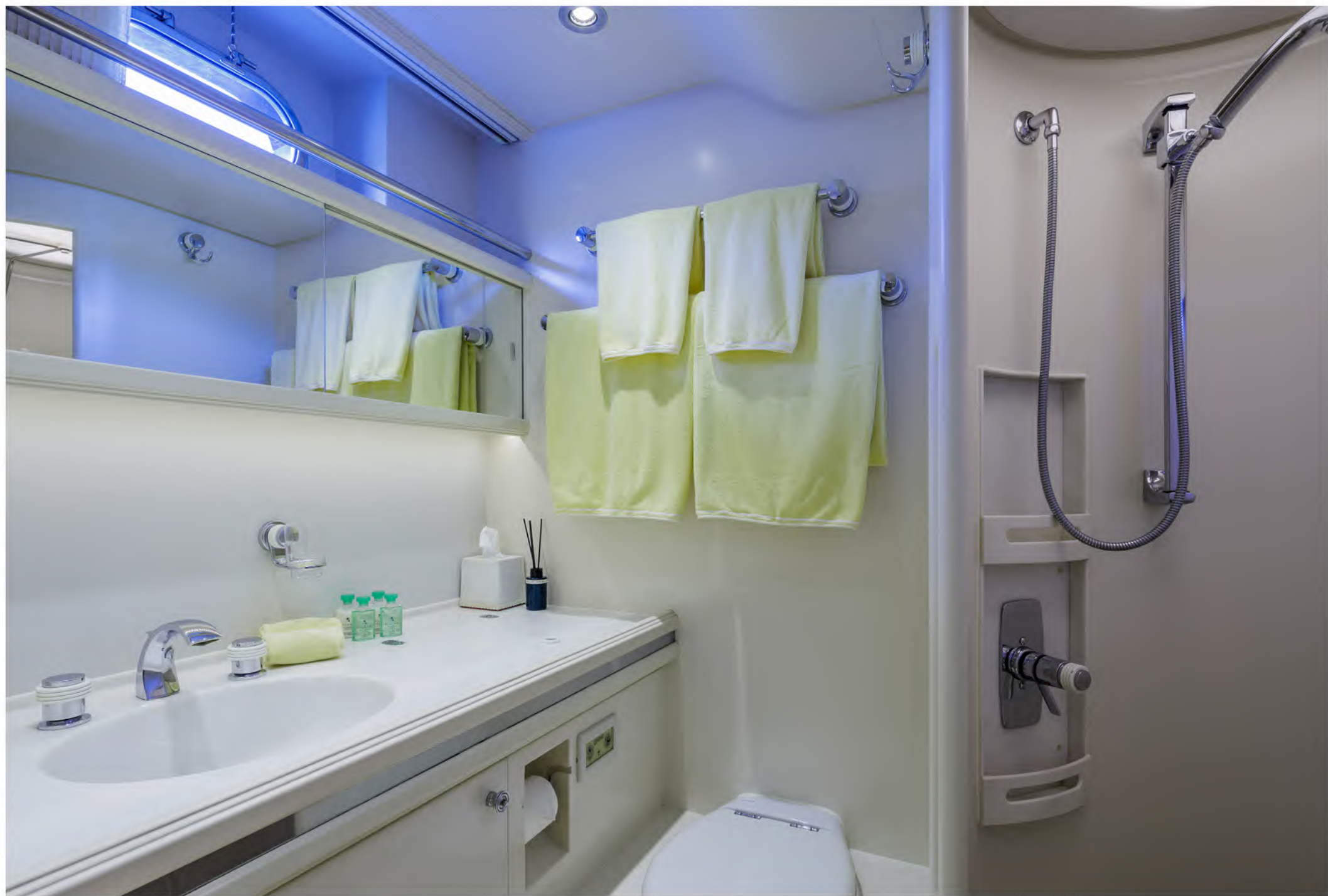
■ twin cabin ensuite