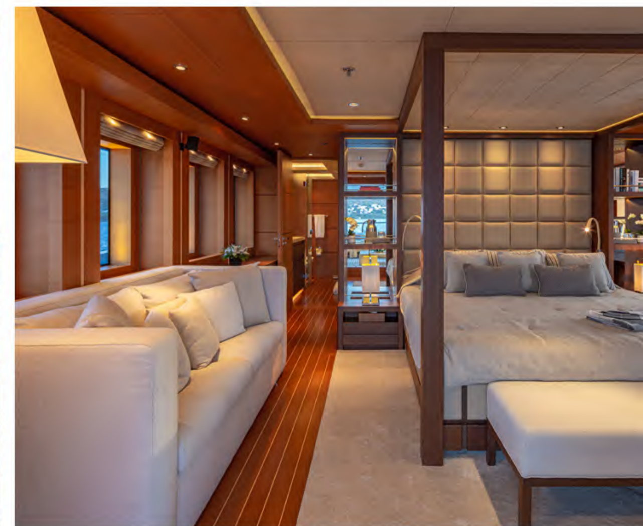
The Master Cabin features a king size bed, walk in closet and ensuite facilities